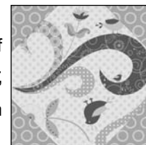
Love Bird Snowball Block

Draw a line from corner to corner on the wrong side of all 4 1/4" x 4 1/4" green love bird cheery circles squares. Place a green square on each corner of the 10 1/2" squares. Sew on the drawn line. Trim excess seam allowance. Press. Make a total of 10 snowball blocks.