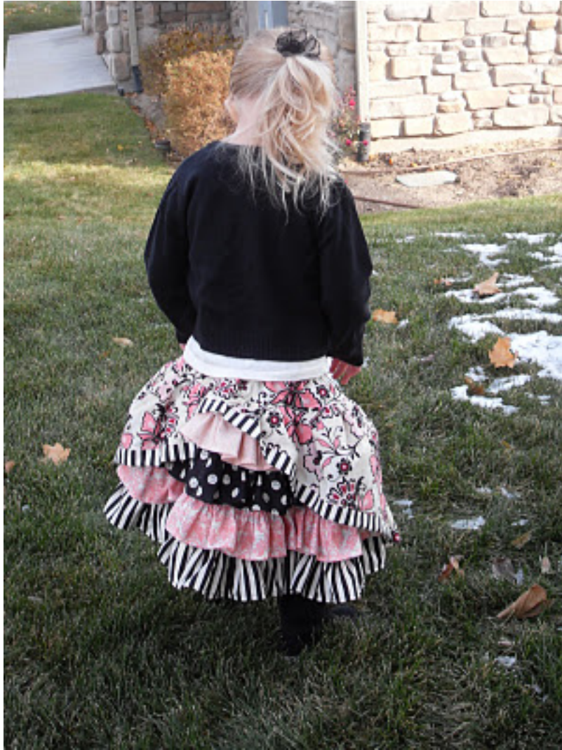
View from the front.