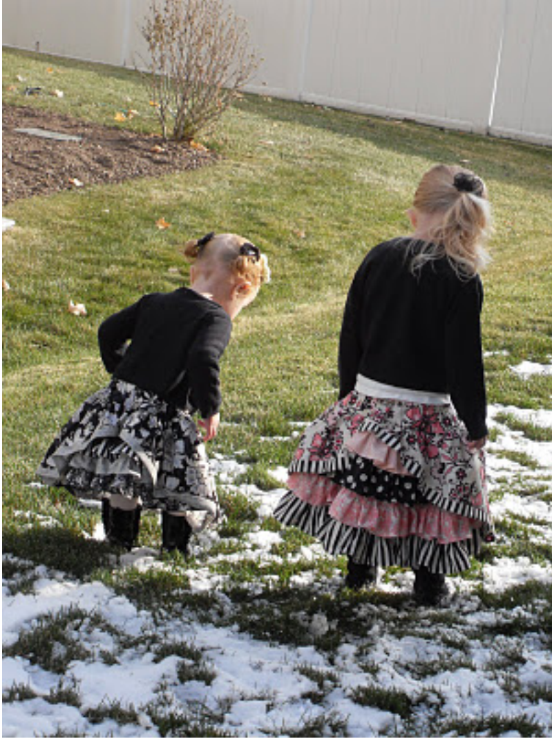
Now my ladies are all set for Christmas outfits!