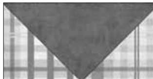
Flying Geese Unit

Refer to quilt photo for placement of fabrics. These instructions are to make 1 Great Outdoors Block. Sew a green plaid triangle to both sides of a chocolate triangle to create a Flying Geese Unit. Repeat to create 4 Flying Geese Units. Sew a Flying Geese Unit to each side of a 4 1/2" cream damask square or a 4 1/2" green trees square. Sew a 2 1/2" green damask square and a 2 1/2" brown leaves square to each side of the 2 remaining Flying Geese Units. Sew the 3 rows together to complete the Great Outdoors Block. Repeat to make 25 Great Outdoors Blocks (13 Cream Damask Centers, 12 Green Tree Centers).