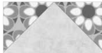
Flying Geese Unit

Sew a small assorted print triangle to each side of a piña colada triangle to create the Flying Geese Unit. Repeat to make a total of 80 Flying Geese Units.