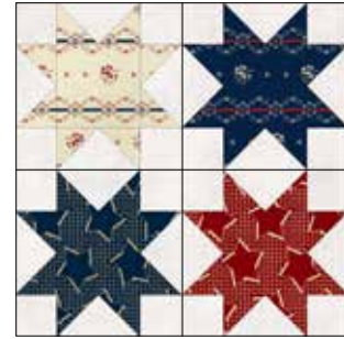
Four-Patch Star Block

Referring to quilt photo for Star Unit placement, sew 4 Star Units together to create a 4-Patch Star Block. Repeat to create 16 Four-Patch Star Blocks.