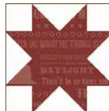
Corner Star Center

Sew a Unit D to the top and bottom of Unit C to create the Corner Star Center. Repeat to make a total of 4 Corner Star Centers.