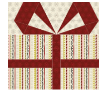
Gift Wrapped Block

Sew the Bow Unit and the Box Unit together to create the Gift Wrapped Block. Repeat to create 16 Gift Wrapped Blocks.