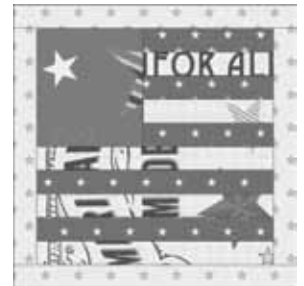
Stars and Stripes Block