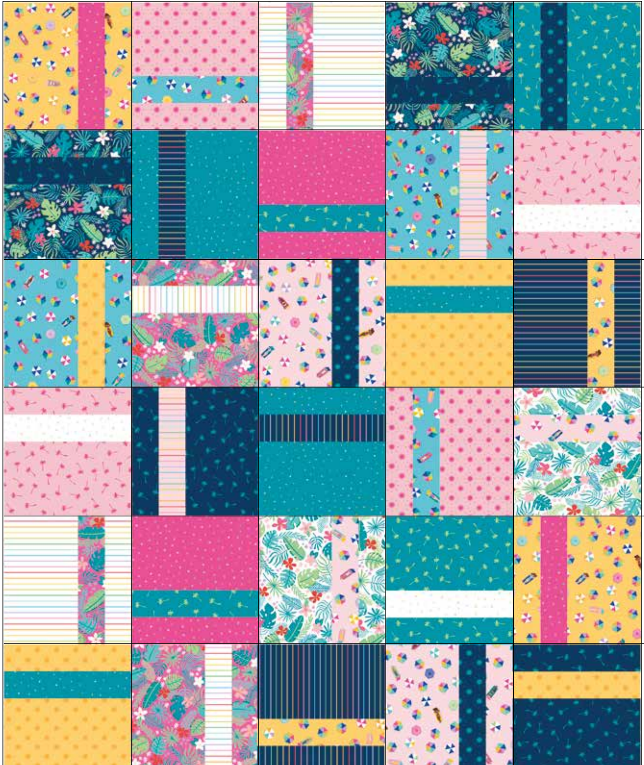
Quilt Center Diagram