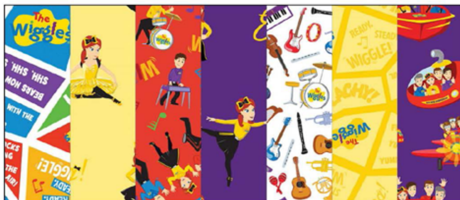
Figure 2 – Make 4.

2. Sew together seven 2-1/2" x 6-1/2" rectangles in the following order: A, B, C, D, E, G, and F (figure 2). Press seams in one direction. Repeat to make four 6-1/2" x 14-1/2" blocks.