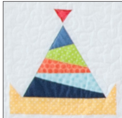
Party Hat Block