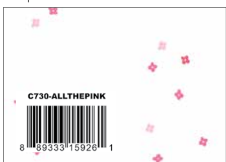
All the Pink Blossom