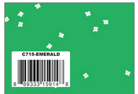
Emerald City Blossom