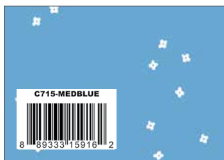
Medium Blue Blossom