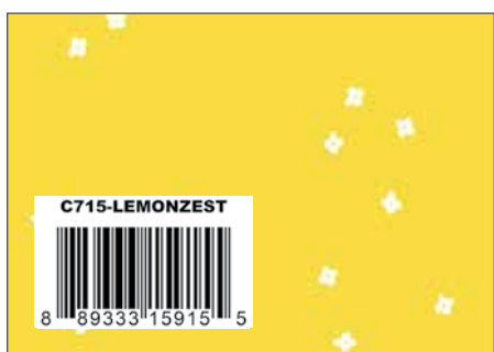
Lemon Zest Blossom