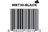
Black Blossom Reversed