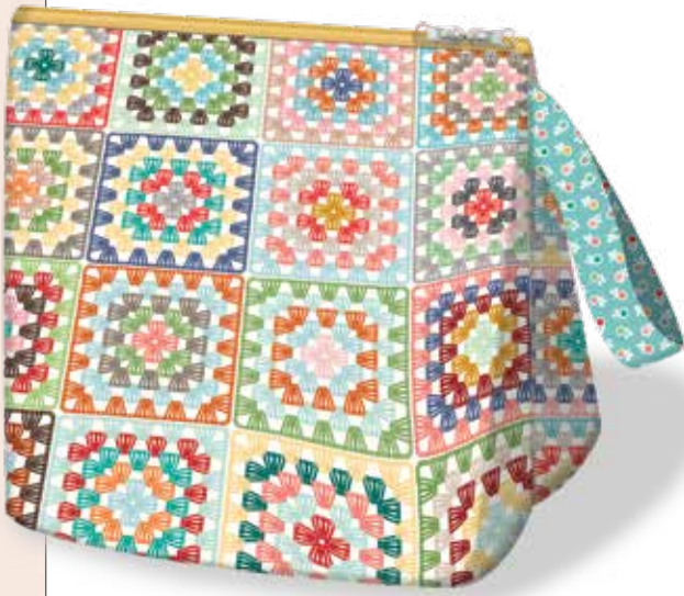
Happy Crochet Bags Home Dec Panel Scaled to 20% | Actual Size is 36" x 54"