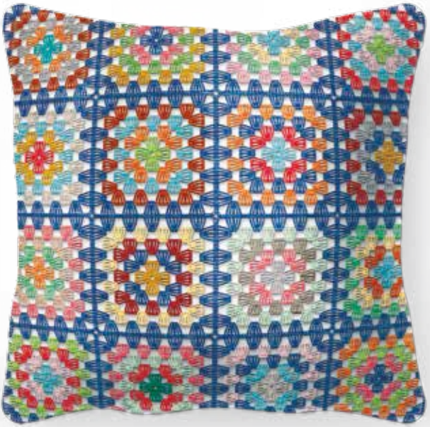
Denim Crocheted Pillow