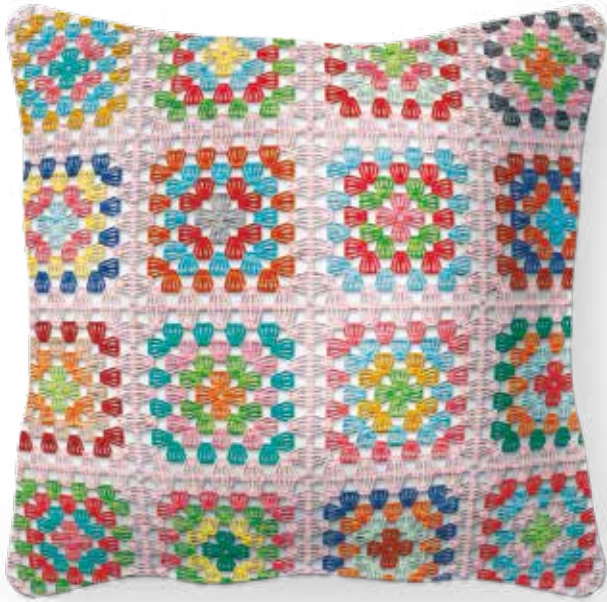
Frosting Crocheted Pillow