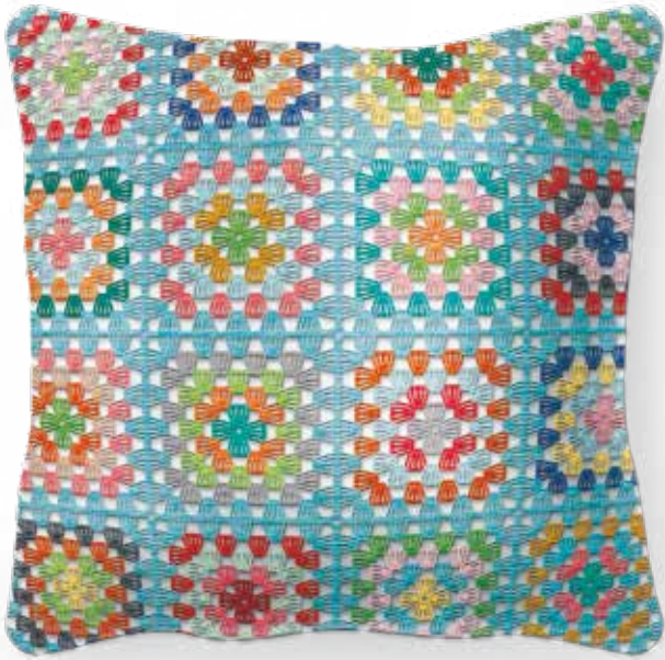
Breezy Crocheted Pillow