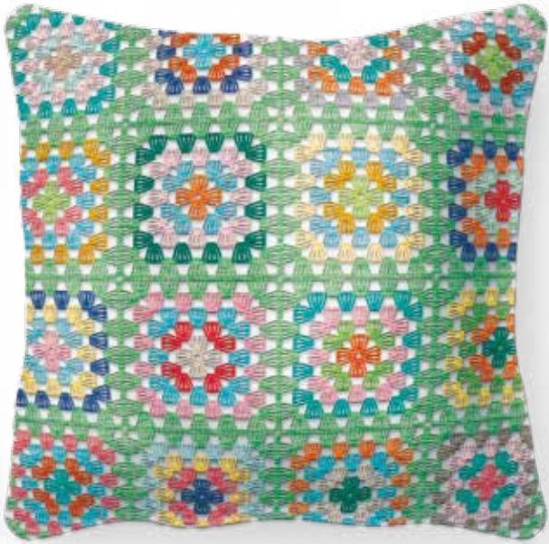
Leaf Crocheted Pillow