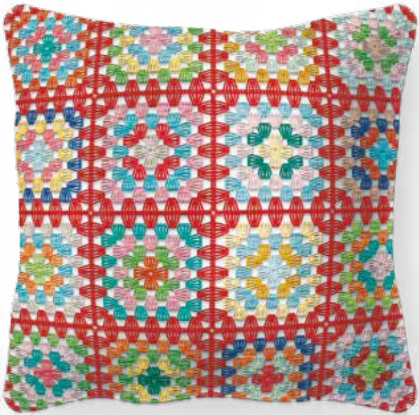
Red Crocheted Pillow