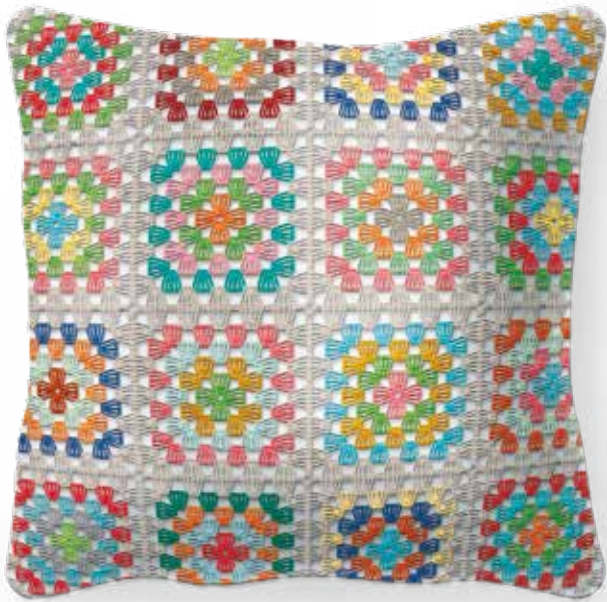
Linen Crocheted Pillow