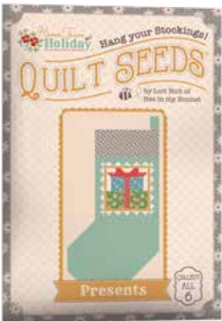
Presents No. 4