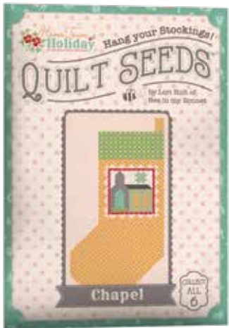
Chapel No. 5