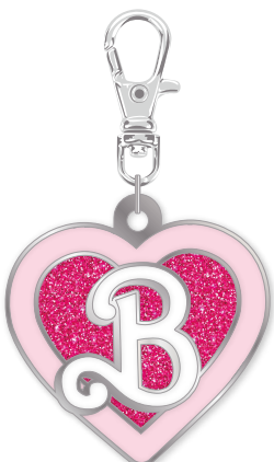
Signature B for Barbie™