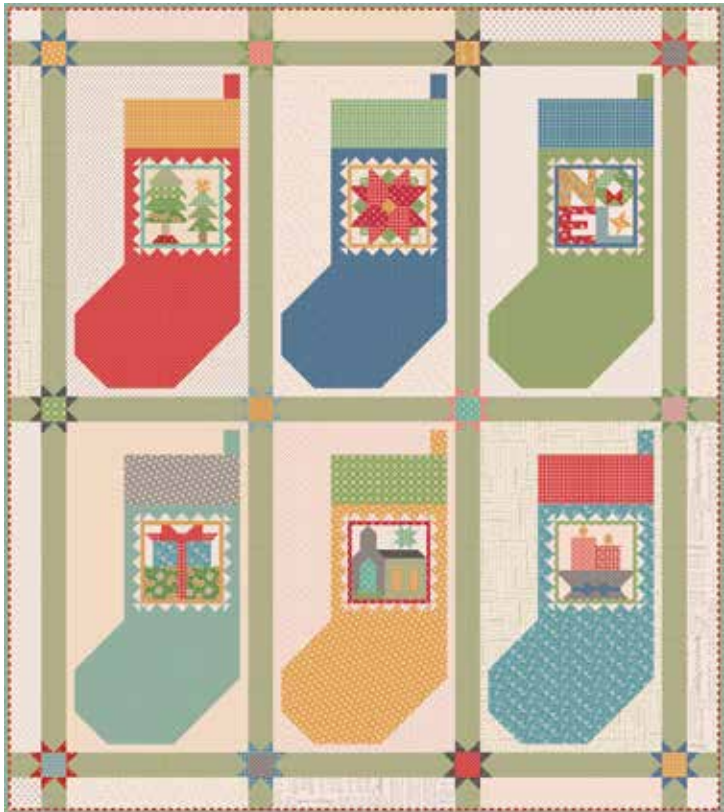
Quilt Size 86" x 97"

Quilt Setting Instructions included in EACH package and as a FREE download on the Riley Blake Designs Website July 2024