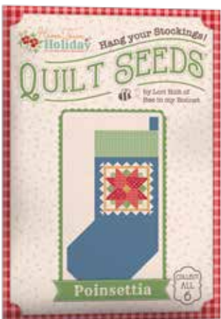
Poinsettia No. 2