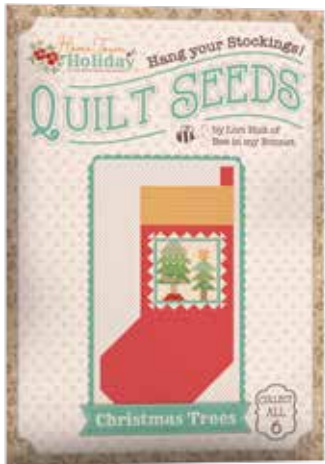
Christmas Tree No. 1