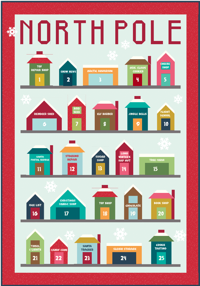
Quilt Size 67" x 95"

Take a magical trip to the North Pole with this fun, traditionally pieced, beginner-friendly quilt pattern. Sew the snow-capped village together and have fun being creative with a variety of embellishments. There are even options to hand OR machine embroider shop names and building numbers! Turn the doors into pockets for the PERFECT Advent Calendar to cuddle and play with your Santa's Workshop Felt Panel!