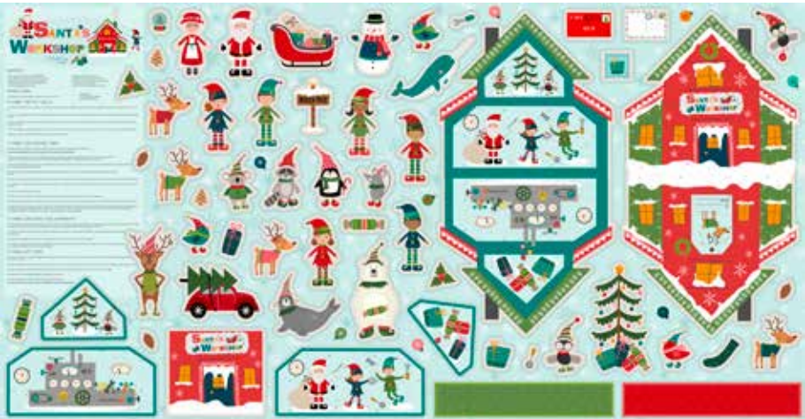
Santa's Workshop Felt Panel (MOQ equals 6 individually packaged FT15070 panels) Scaled to 6% | Actual Size is 36" x 48"