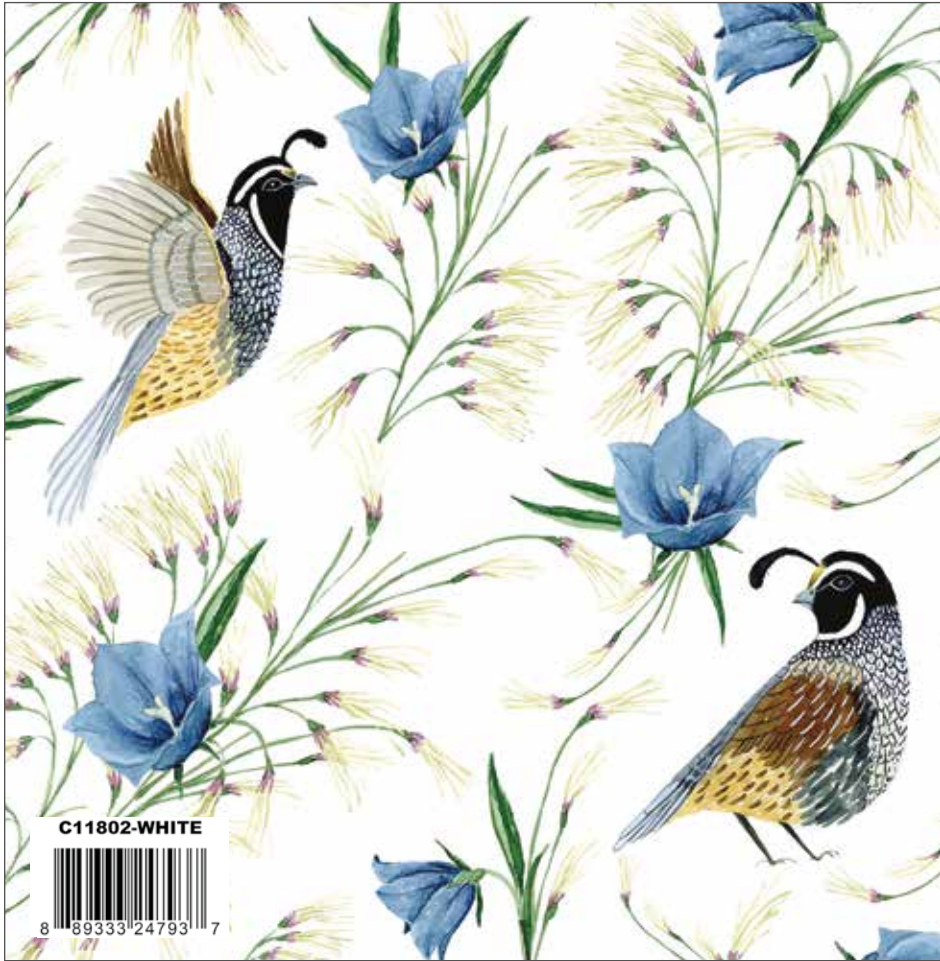
White Golden Poppies Quail