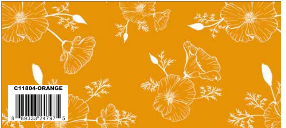
Orange Golden Poppies Tonal