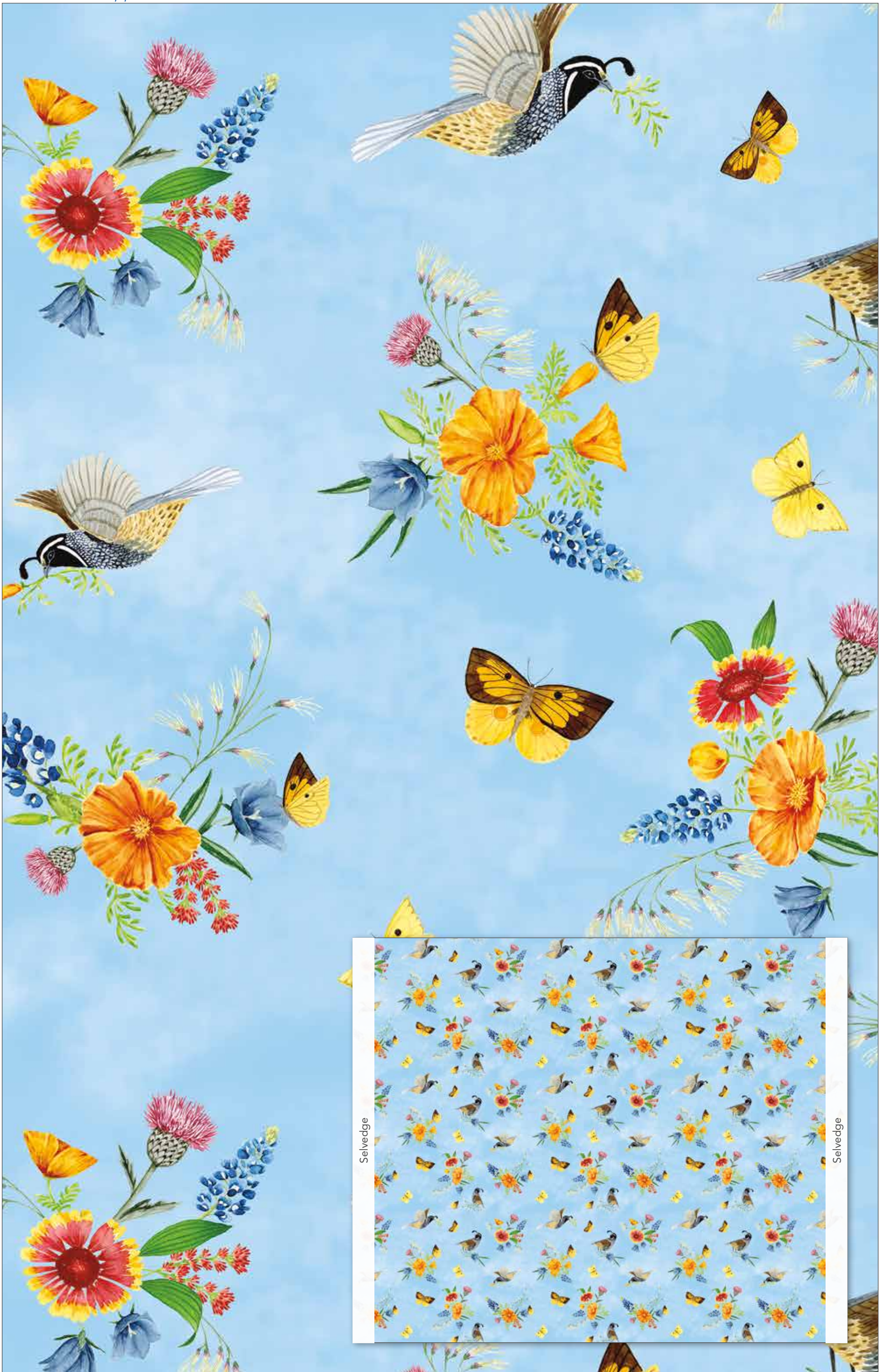
C11800 Blue Golden Poppies Main