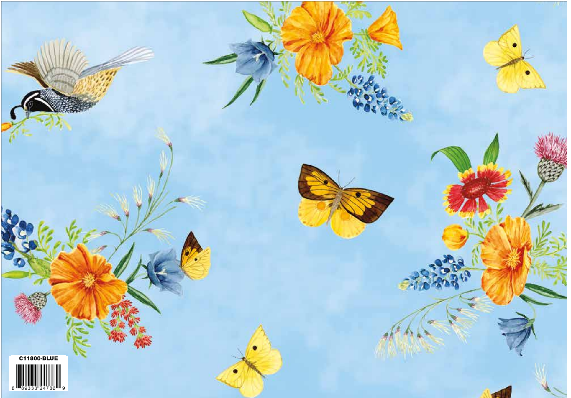
Blue Golden Poppies Main