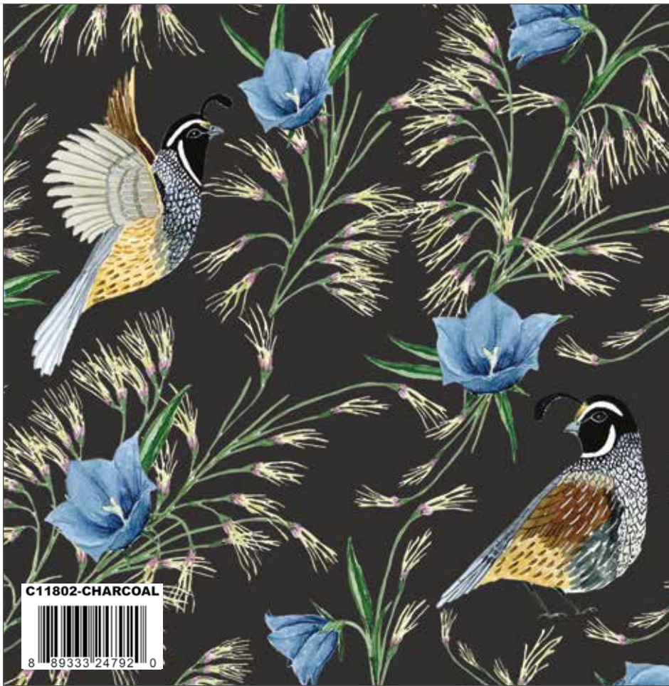
Charcoal Golden Poppies Quail