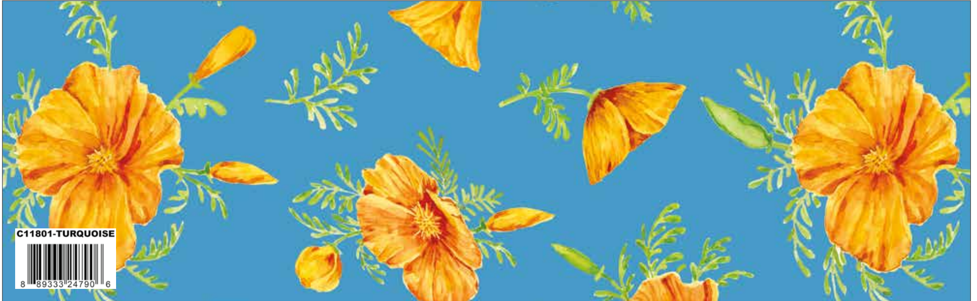
Turquoise Golden Poppies Flowers