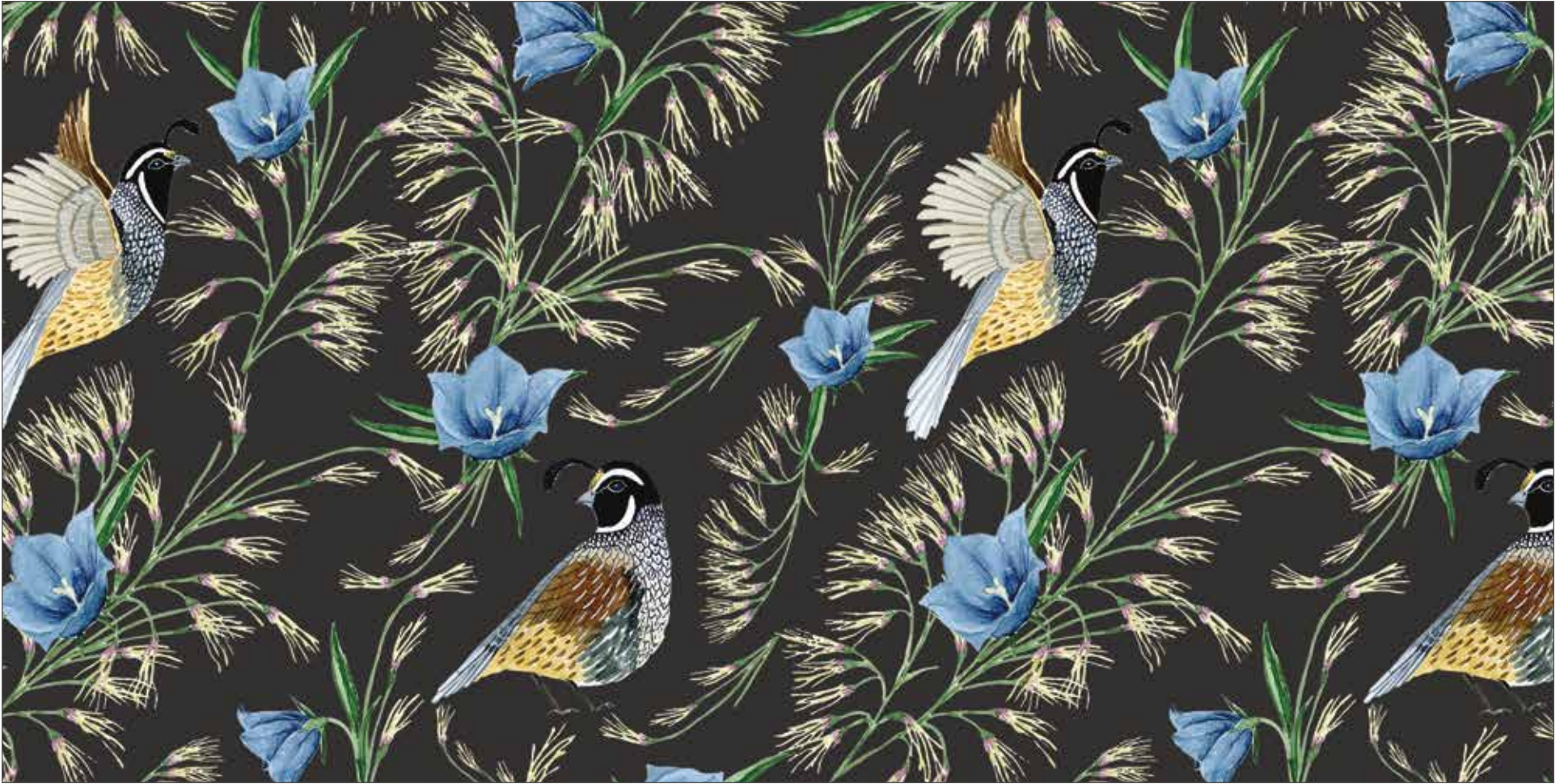
C11802 Charcoal Golden Poppies Quail