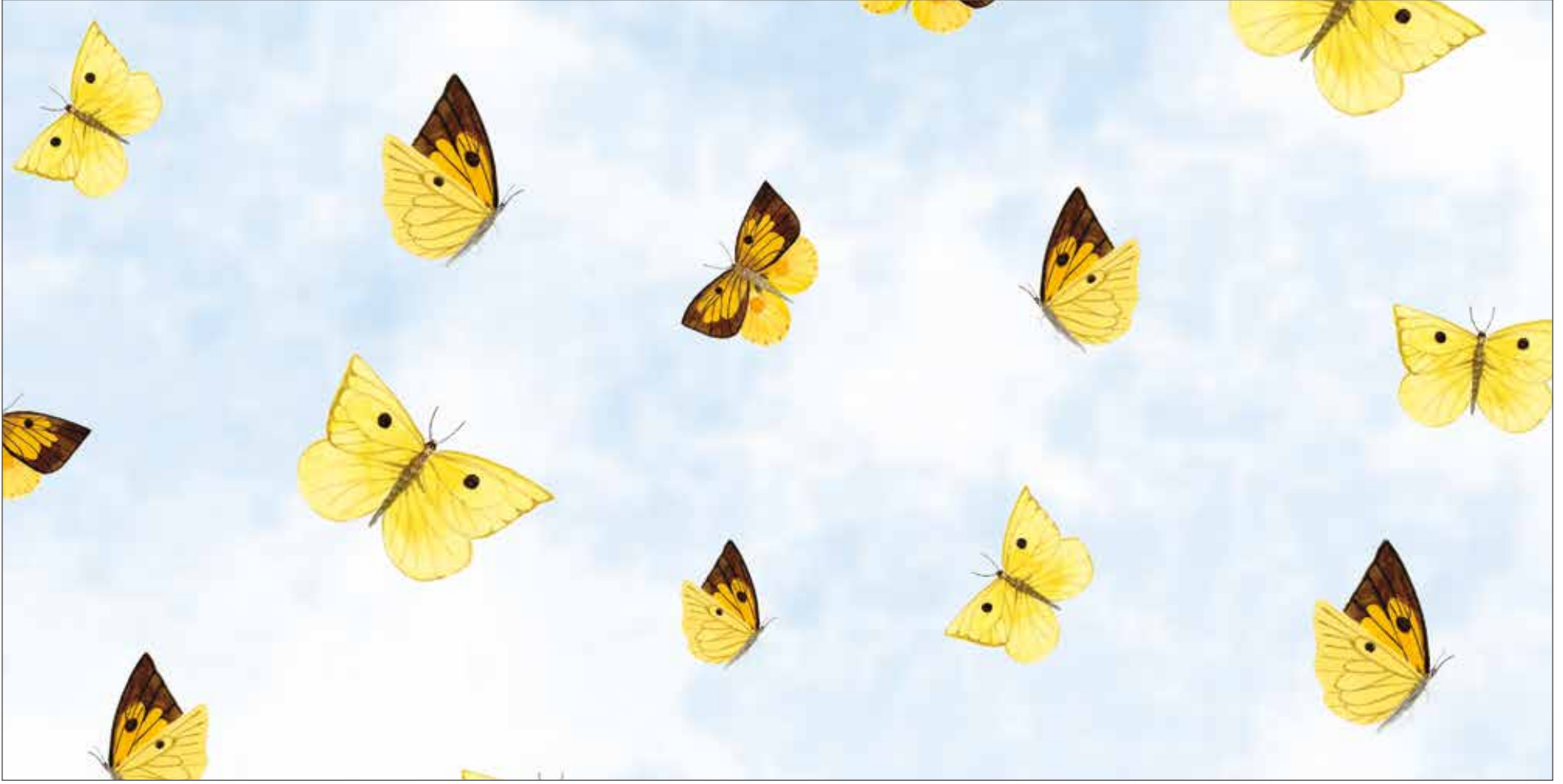
C11803 White Golden Poppies Butterflies