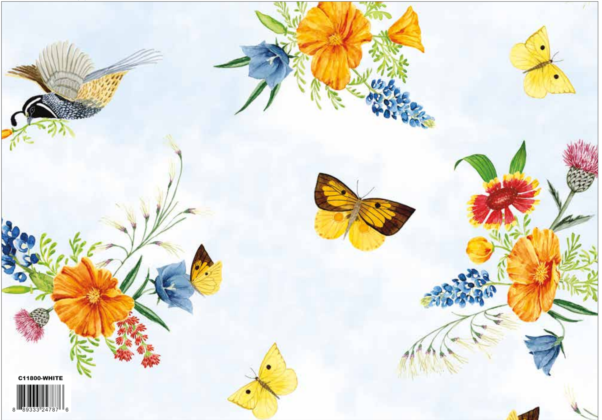
White Golden Poppies Main