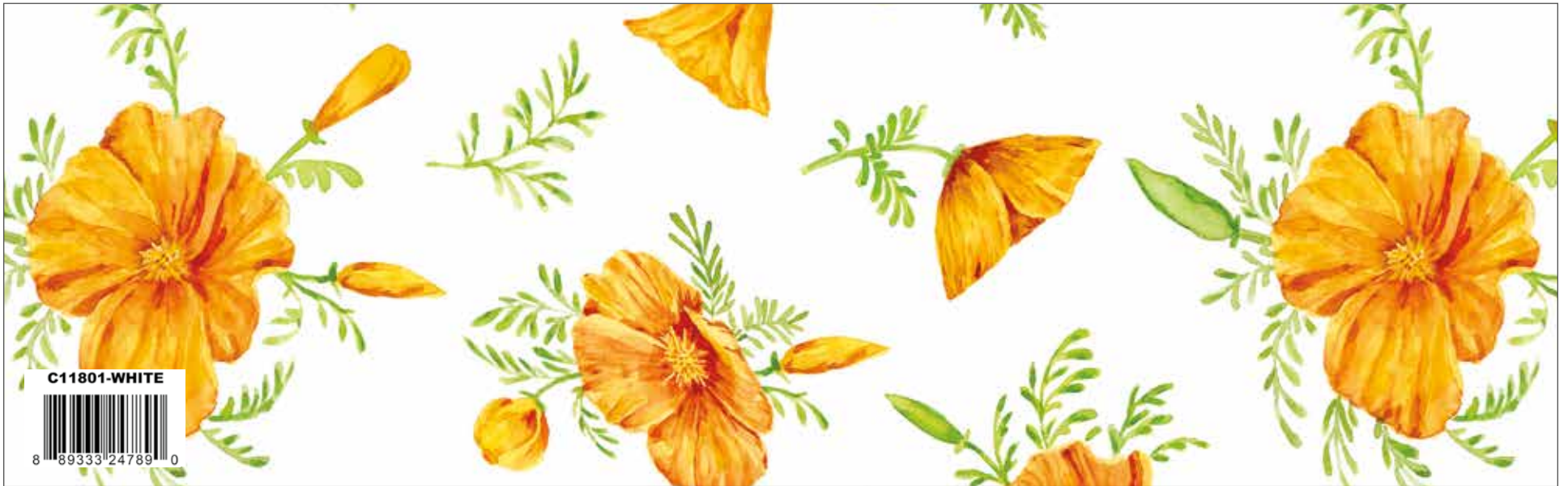
White Golden Poppies Flowers