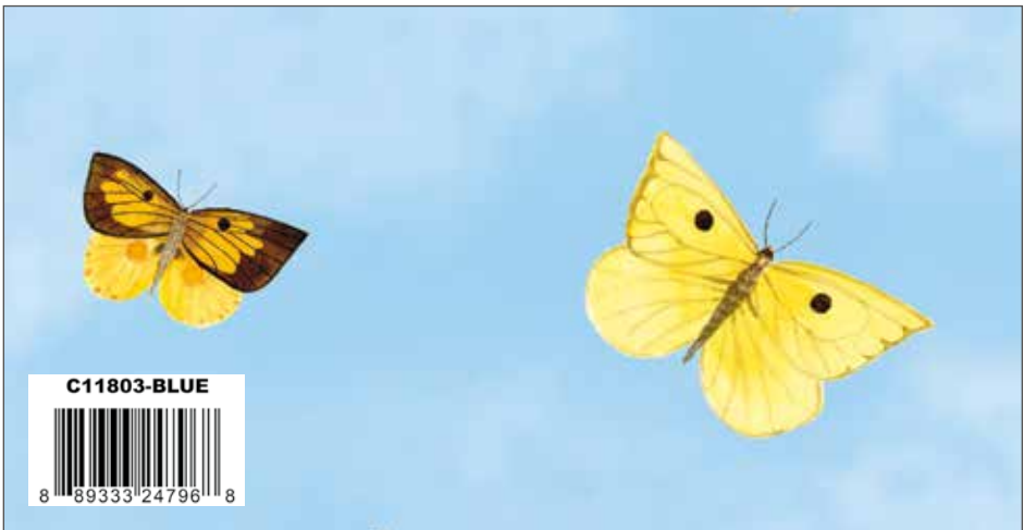
Blue Golden Poppies Butterflies