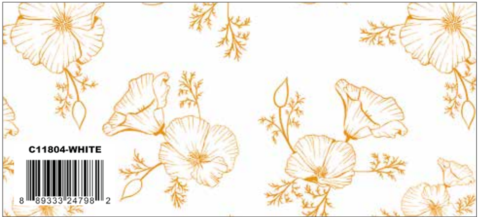
White Golden Poppies Tonal