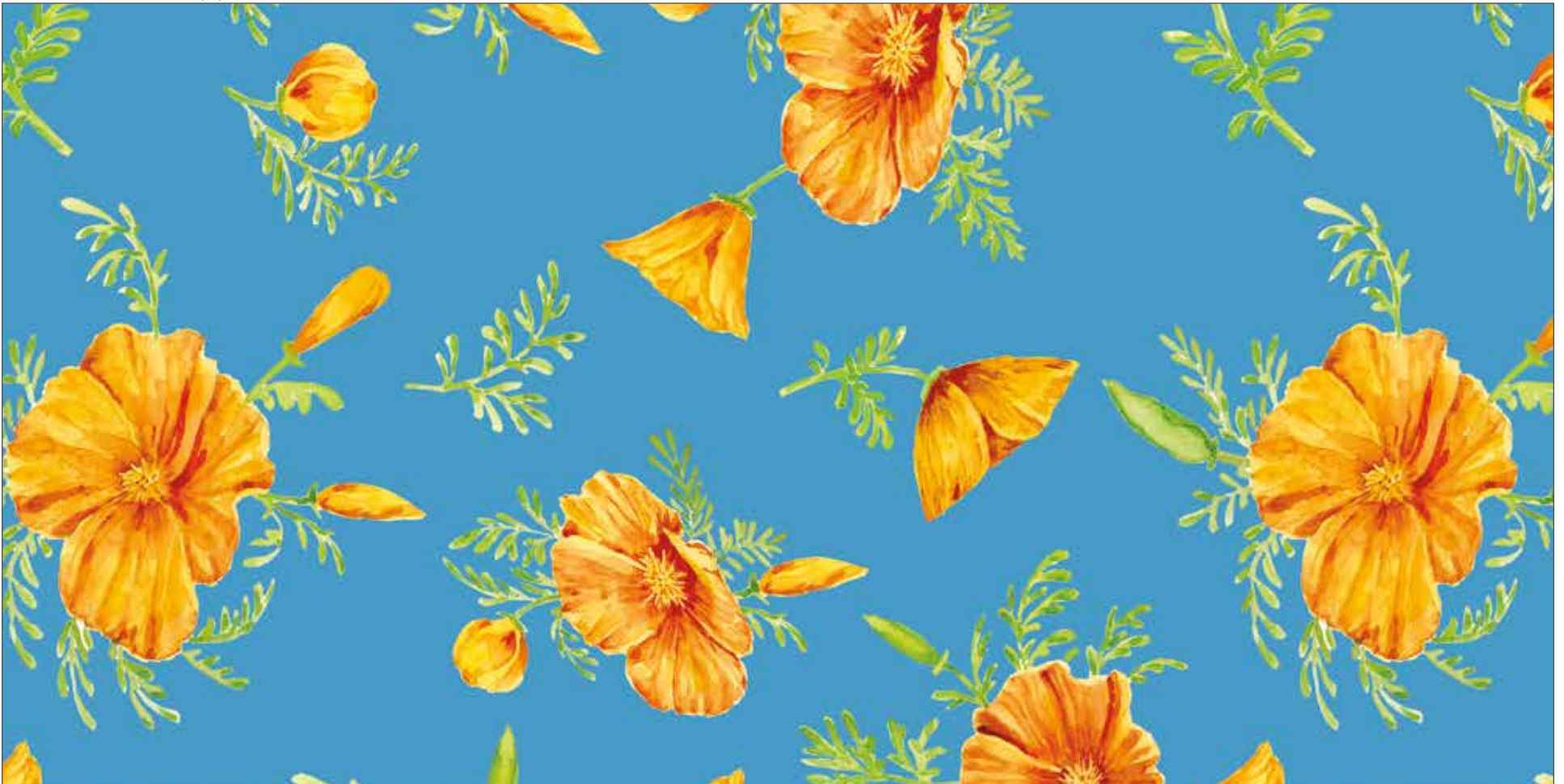
C11801 Turquoise Golden Poppies Flowers