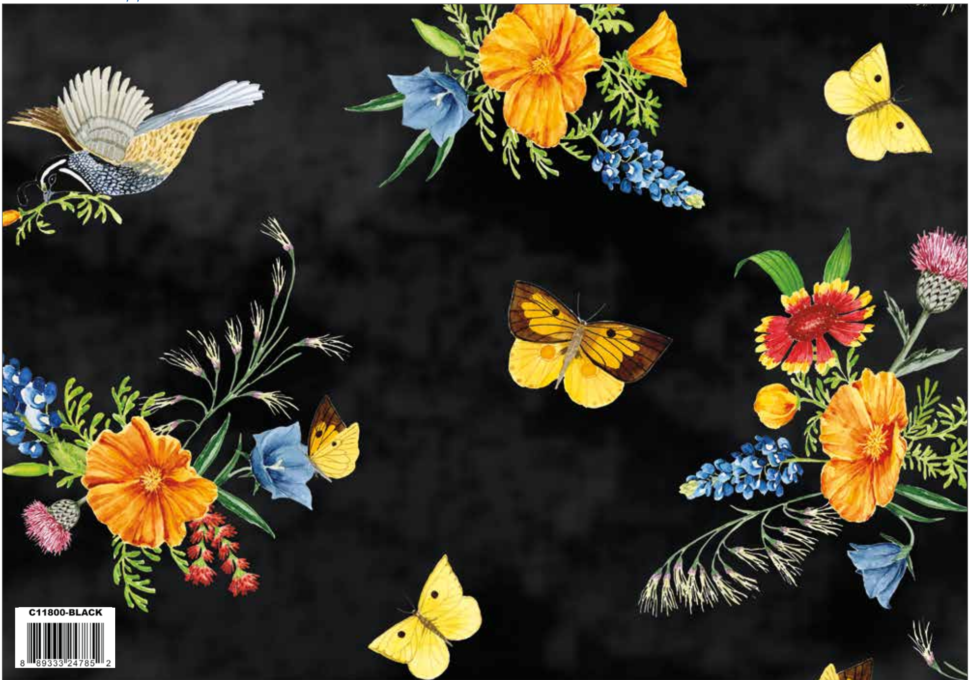
Black Golden Poppies Main