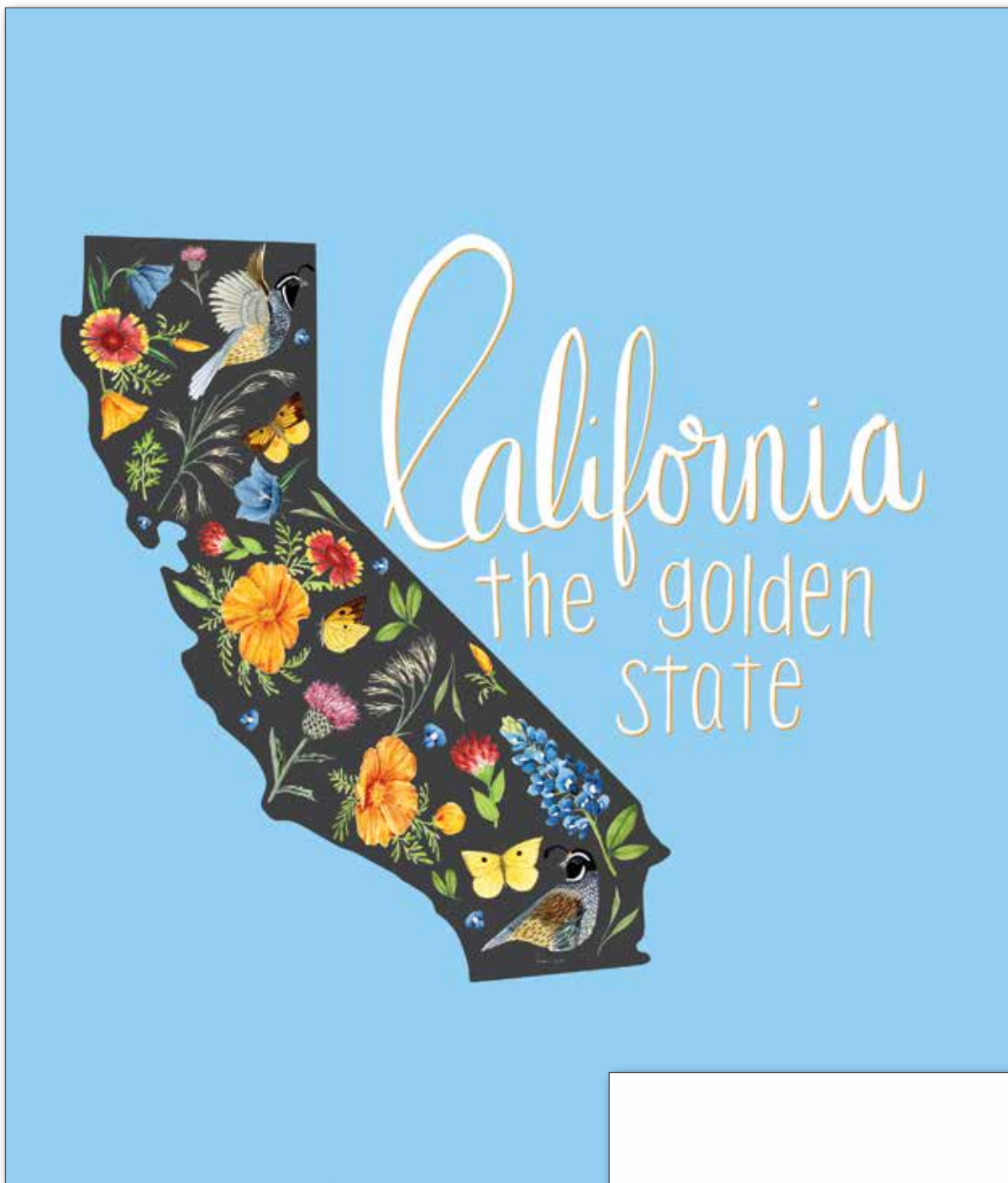
Blue California Panel Scaled to 17% | Actual Size is 36" x 43½"