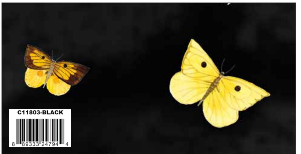
Black Golden Poppies Butterflies