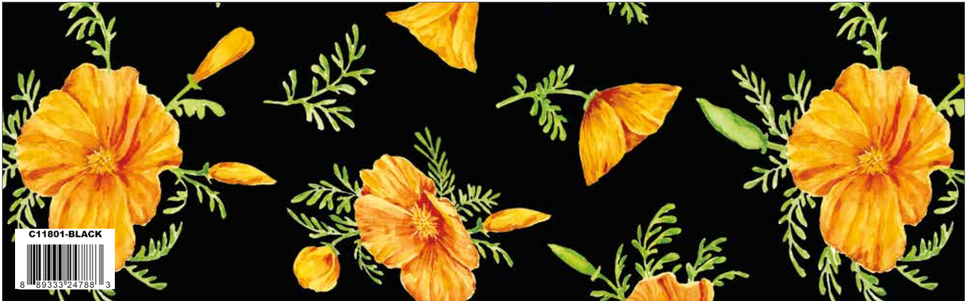
Black Golden Poppies Flowers