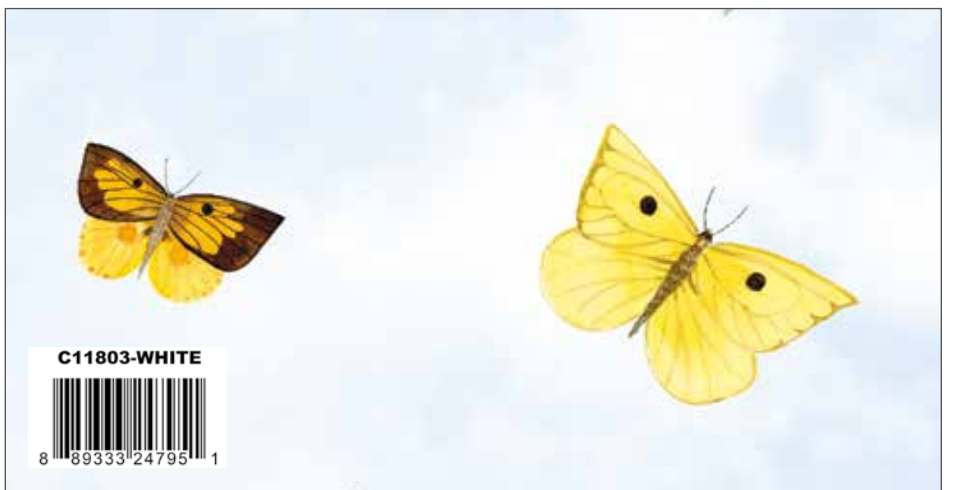
White Golden Poppies Butterflies