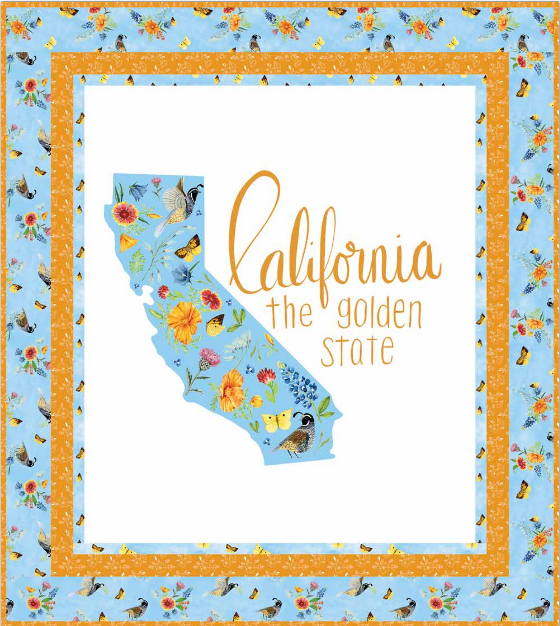
Quilt Size 49" x 55"