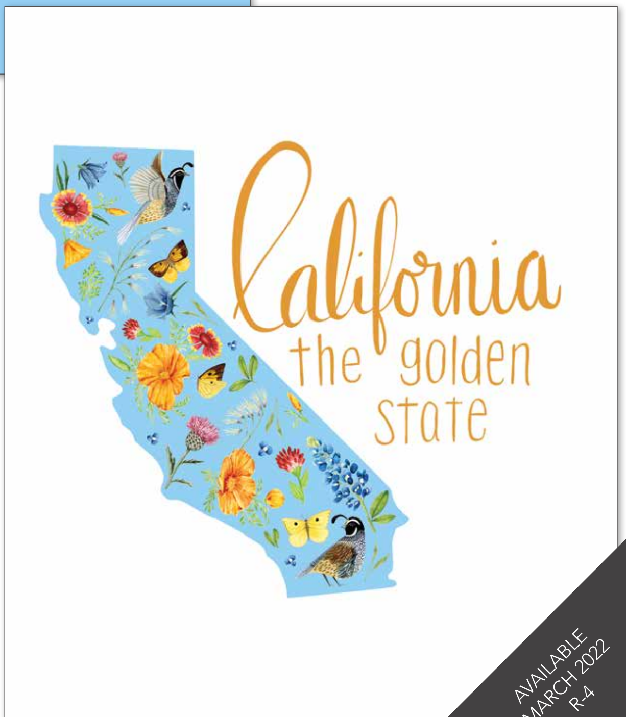
White California Panel Scaled to 17% | Actual Size is 36" x 43½"