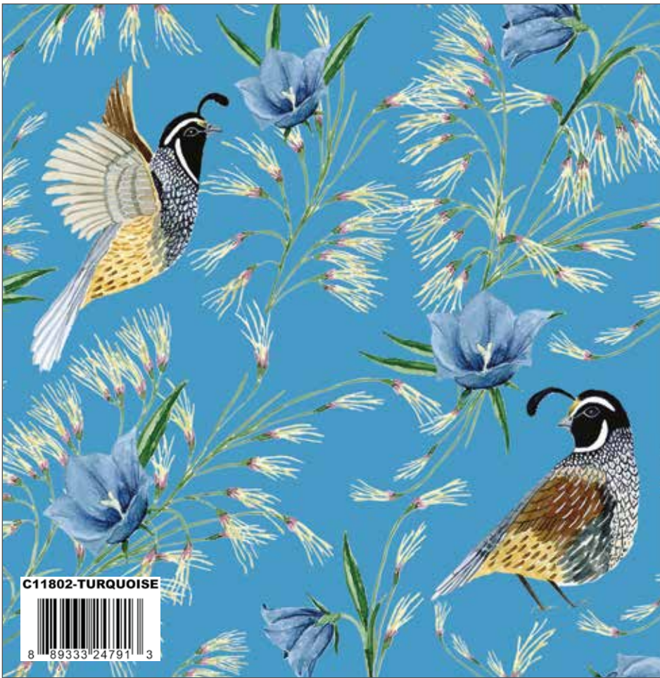
Turquoise Golden Poppies Quail