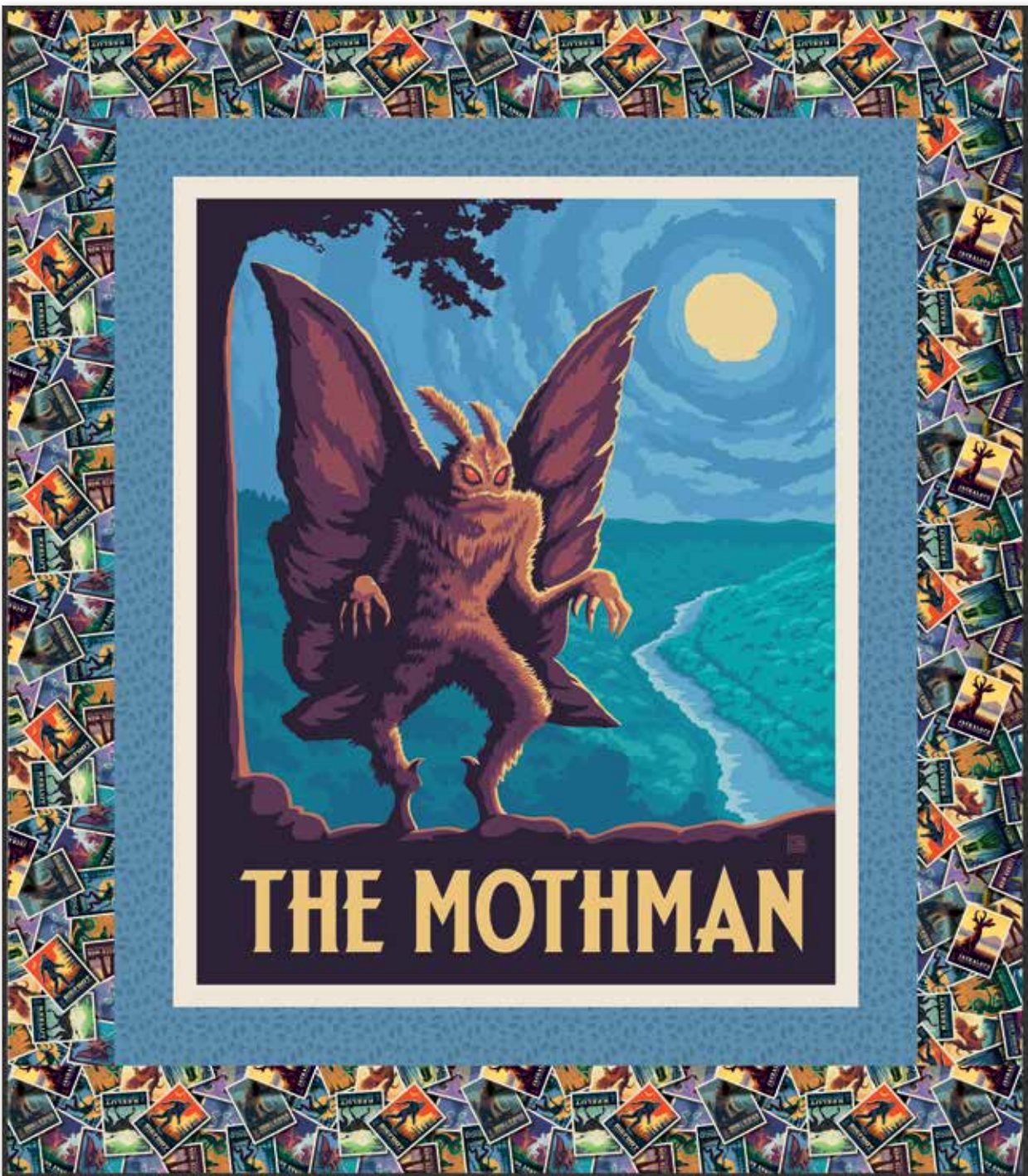
Quilt Size 52½" x 60"