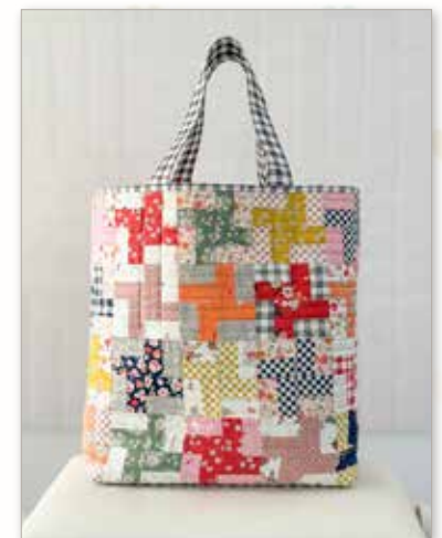
Quilter's Big Tote