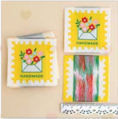
Bloom Note 2 Woven Labels 2" x 2"