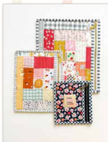
Flatmates Pouch Trio