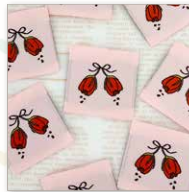
Tulip Woven Labels 1 1/2" x 1 1/2"