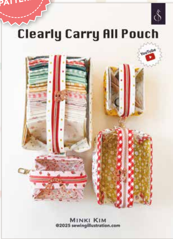
Clearly Carry All Pouch