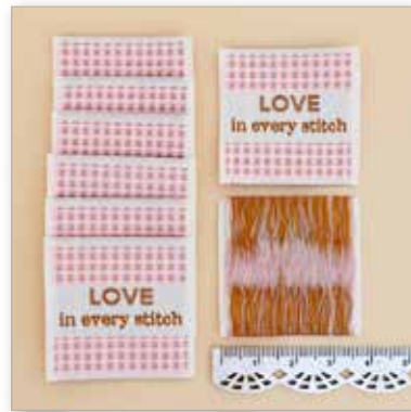
Pink Check Love Woven Labels 1 1/2" x 1 1/2"