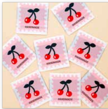
Cherry Pink Woven Labels 2" x 2"