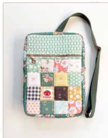
Swing and Sling