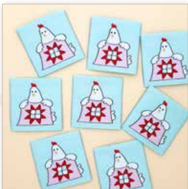
Quilty Hen Woven Labels 1¾" x 1¾"