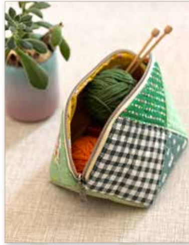
Cris Cross Pouch