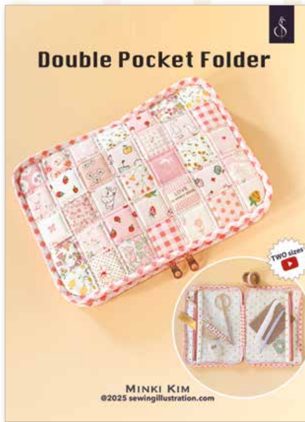
Double Pocket Folder