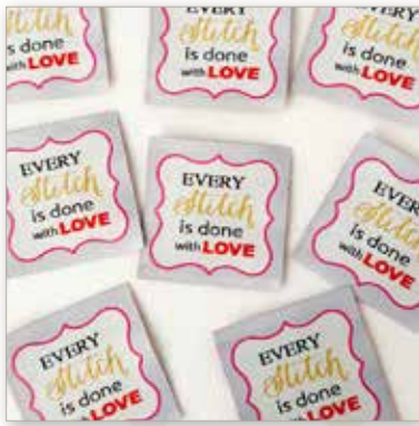
Every Stitch Woven Labels 2" x 2"