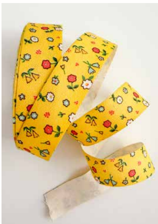
Lemon Cotton Ribbon