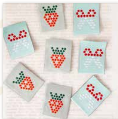
Mosaic Woven Labels 1" x 1 1/4"