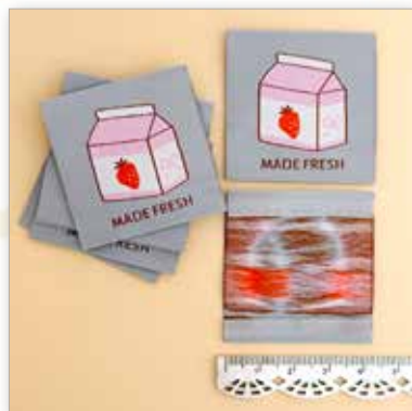
Made Fresh Woven Labels 1 3/4" x 1 3/4"