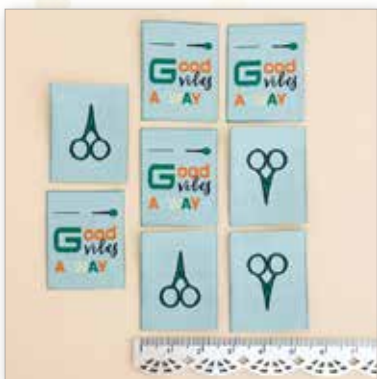
Good Vibes 2 Woven Labels 1" x 1 1/4"