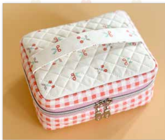
Daily Essential Pouch