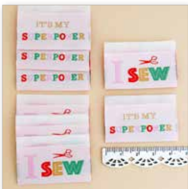
Superpower 2 Woven Labels 1 3/4" x 1 1/4"