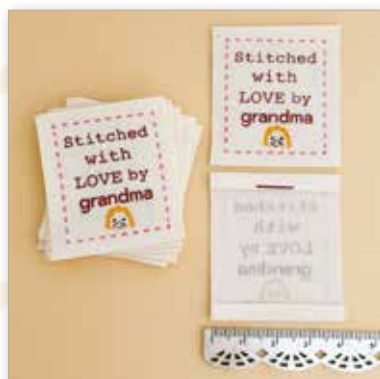
Love by Grandma 100% Cotton Labels 1 1/2" x 1 3/4"