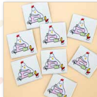
Sewing Chicken Woven Labels 1¾" x 1¾"