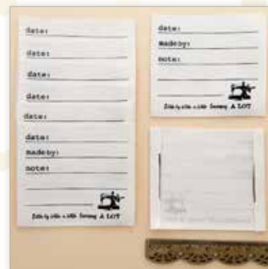
Note 100% Cotton Labels 2 1/4" x 2"