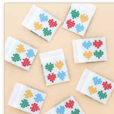
Heart Stitch Folded Woven Labels 1" x 1¼"