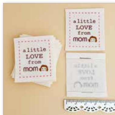
Love from Mom 100% Cotton Labels 1 1/2" x 1 3/4"