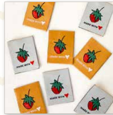
Made with Love Woven Labels 1" x 1 1/4"