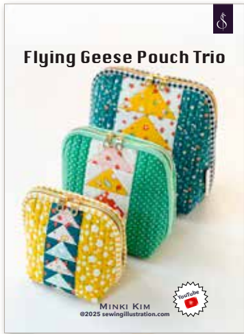
Flying Geese Pouch Trio

See Minki's Project Tutorials at: www.youtube.com/@MinkiKim/videos Printed Patterns: MOQ 3