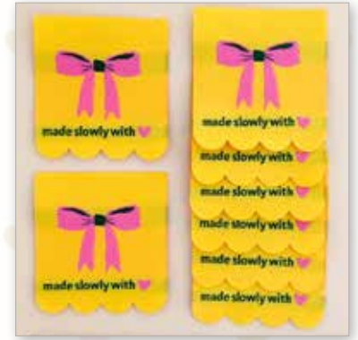
Made Slowly 2 Woven Labels 1" x 1¼"