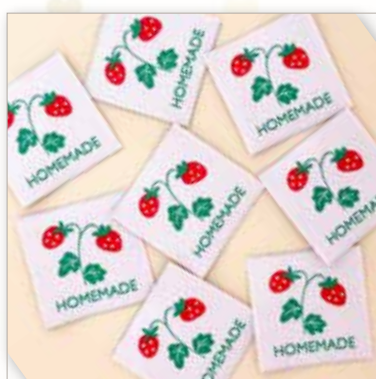
Pink Homemade Woven Labels 1¾" x 1¾"