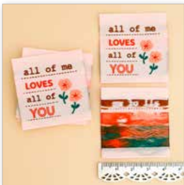
All of Me Woven Labels 1 3/4" x 1 3/4"