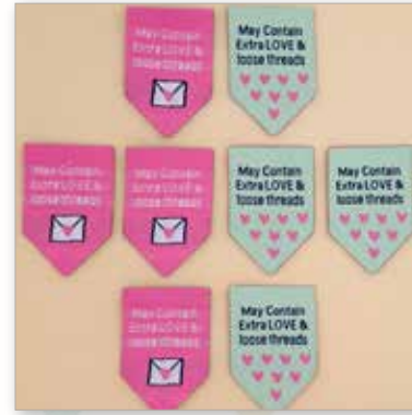
Extra Love Woven Labels 1" x 1½"