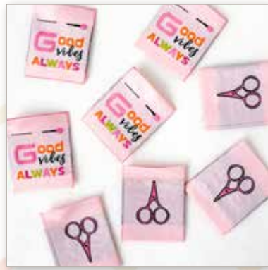
Good Vibes Woven Labels 1" x 1 1/4"