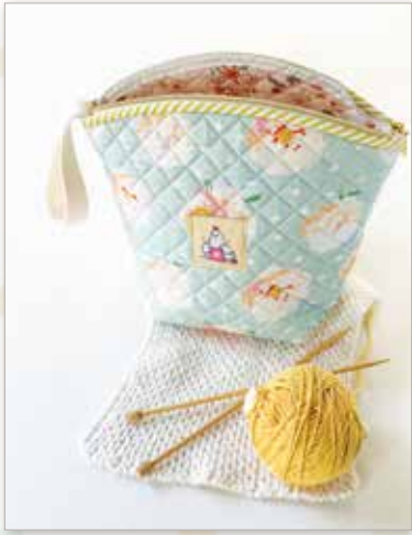
Allover Project Bag

See Minki's Project Tutorials at: www.youtube.com/@MinkiKim/videos Printed Patterns: MOQ 3