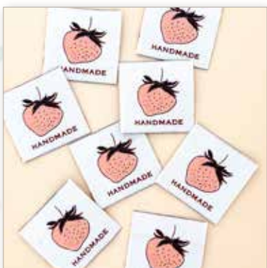
Peach Berry Woven Labels 1½" x 1½"