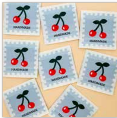
Cherry Blue Woven Labels 2" x 2"