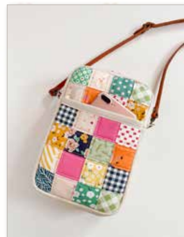
Sun Patch Crossbody Bag