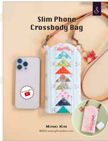
Slim Phone Crossbody Bag