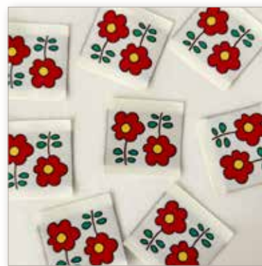
Camellia Woven Labels 2" x 2"