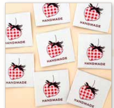
Check Strawberry Woven Labels 2" x 2"