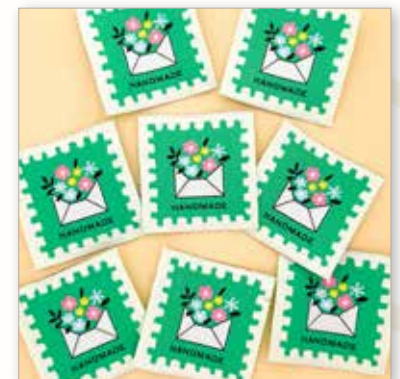
Bloom Note Woven Labels 2" x 2"