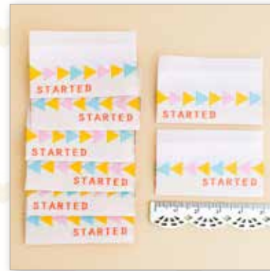
Started Woven Labels 2" x 1 1/4"