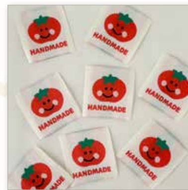
Tomato Handmade Woven Labels 1 1/2" x 1 1/2"