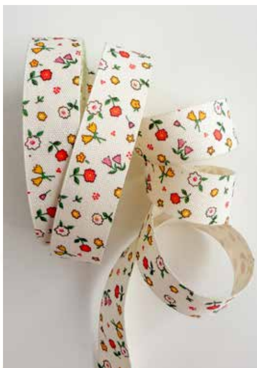
Cream Cotton Ribbon