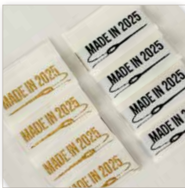
Made in 2025 Woven Labels 1" x 1 1/2"