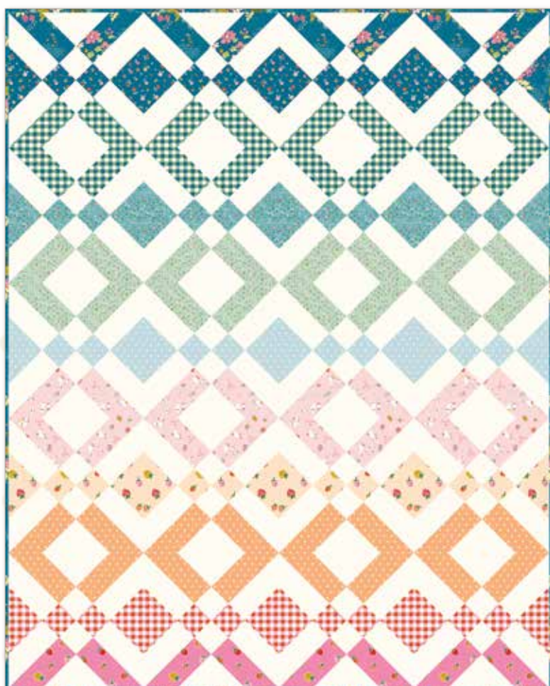
Bloomway Quilt Pattern