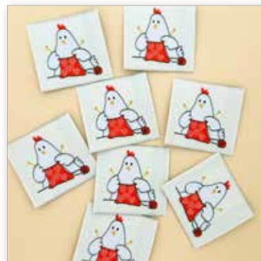
Knitty Hen Woven Labels 1¾" x 1¾"