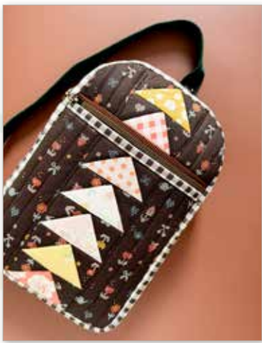
Weekend Sling Bag