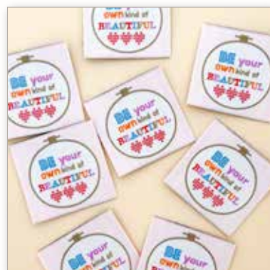
Own Kind Woven Labels 1¾" x 1¾"