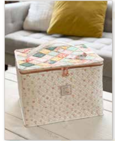
Ultimate Sewing Case