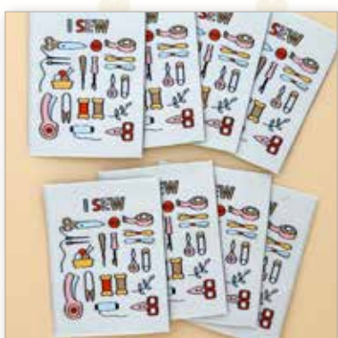
I SEW Woven Labels 2" x 2½"