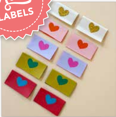
Heart Zipper Tab Woven Labels 1 3/8" x 3/4" (10 label pack)