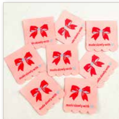
Made Slowly Woven Labels 1 5/8" x 1 3/4"