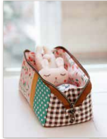
Open Up Box Pouch