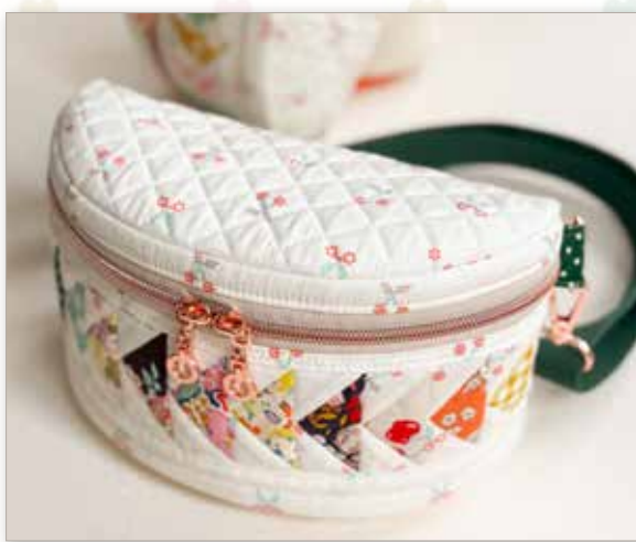
Flying Geese Belt Bag