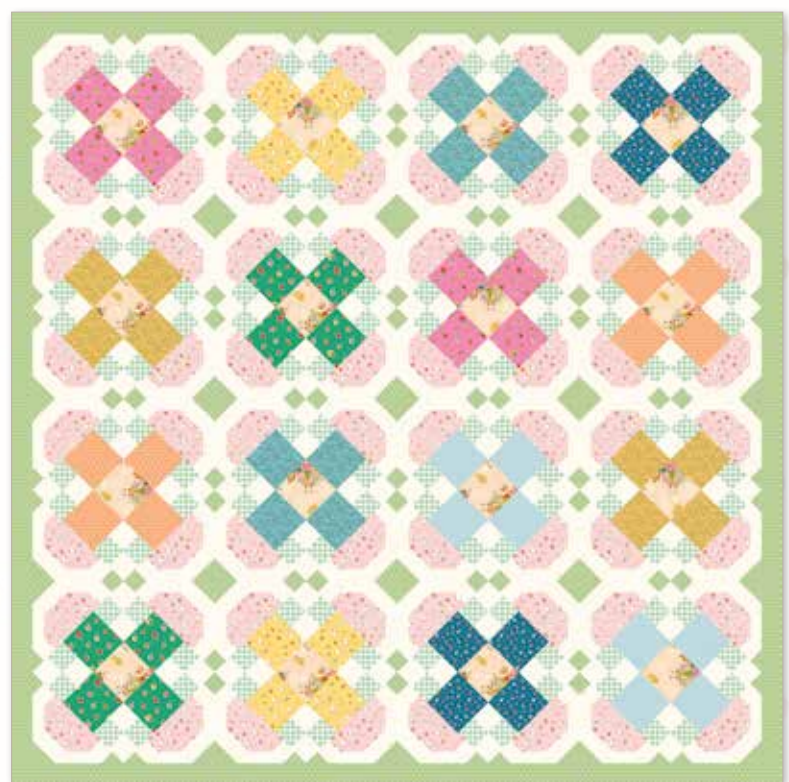
Cottage Garden Quilt Pattern