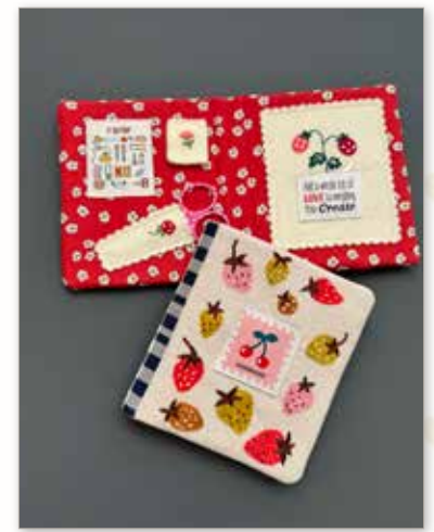
Minki's Needle Book