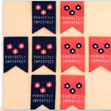
Perfectly Imperfect Woven Labels 1" x 1½"