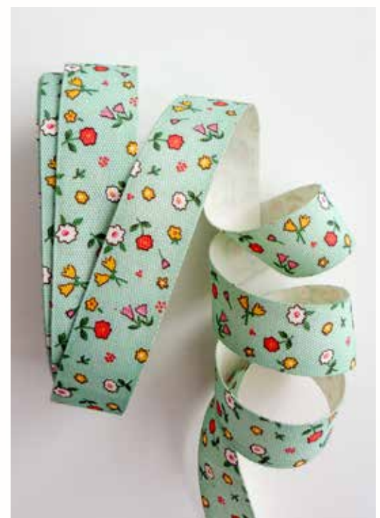
Sweet Mint Cotton Ribbon