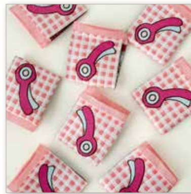
Rotary Cutter Woven Labels 1" x 1 1/4"