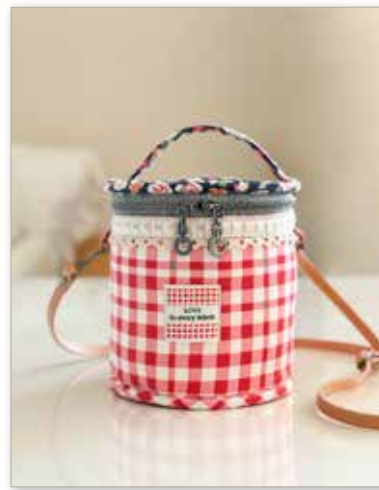
Bliss Bucket Bag