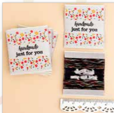
Flower Bed Woven Labels 1 1/2" x 1 1/2"