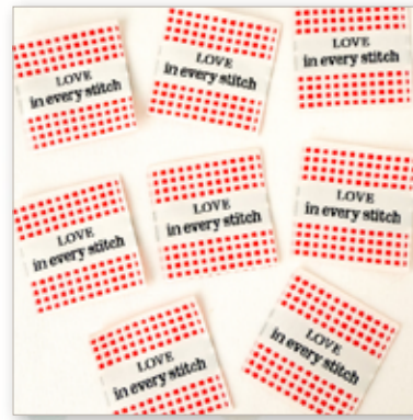
Love in Every Stitch Woven Labels 1 1/2" x 1 1/2"