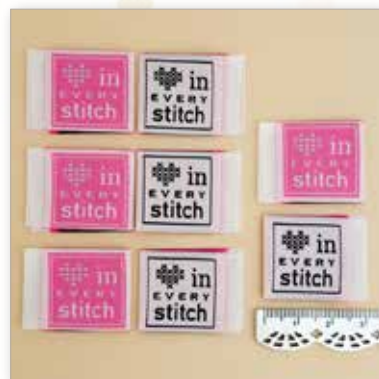
Pink Stitch Woven Labels 1 1/4" x 1"