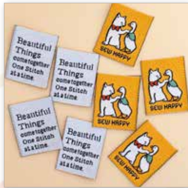
Sew Happy Woven Labels 1" x 1 1/4"