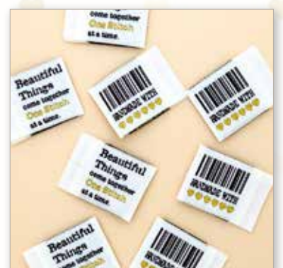
Barcode Folded Woven Labels 1" x 1¼"