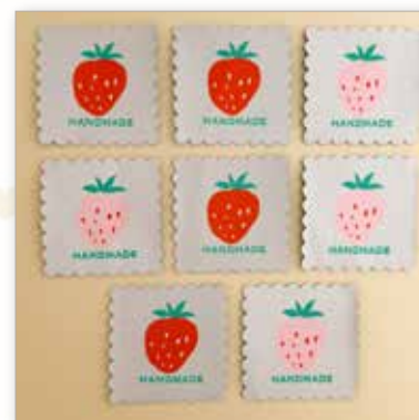
Scalloped Strawberry Woven Labels 1 3/4" x 1 3/4"