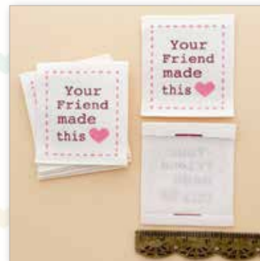
Friend Made 100% Cotton Labels 1 1/2" x 1 3/4"