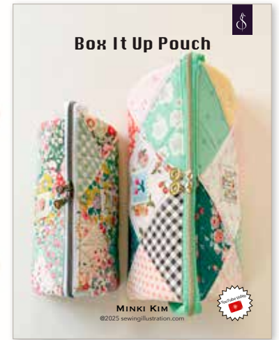
Box It Up Pouch