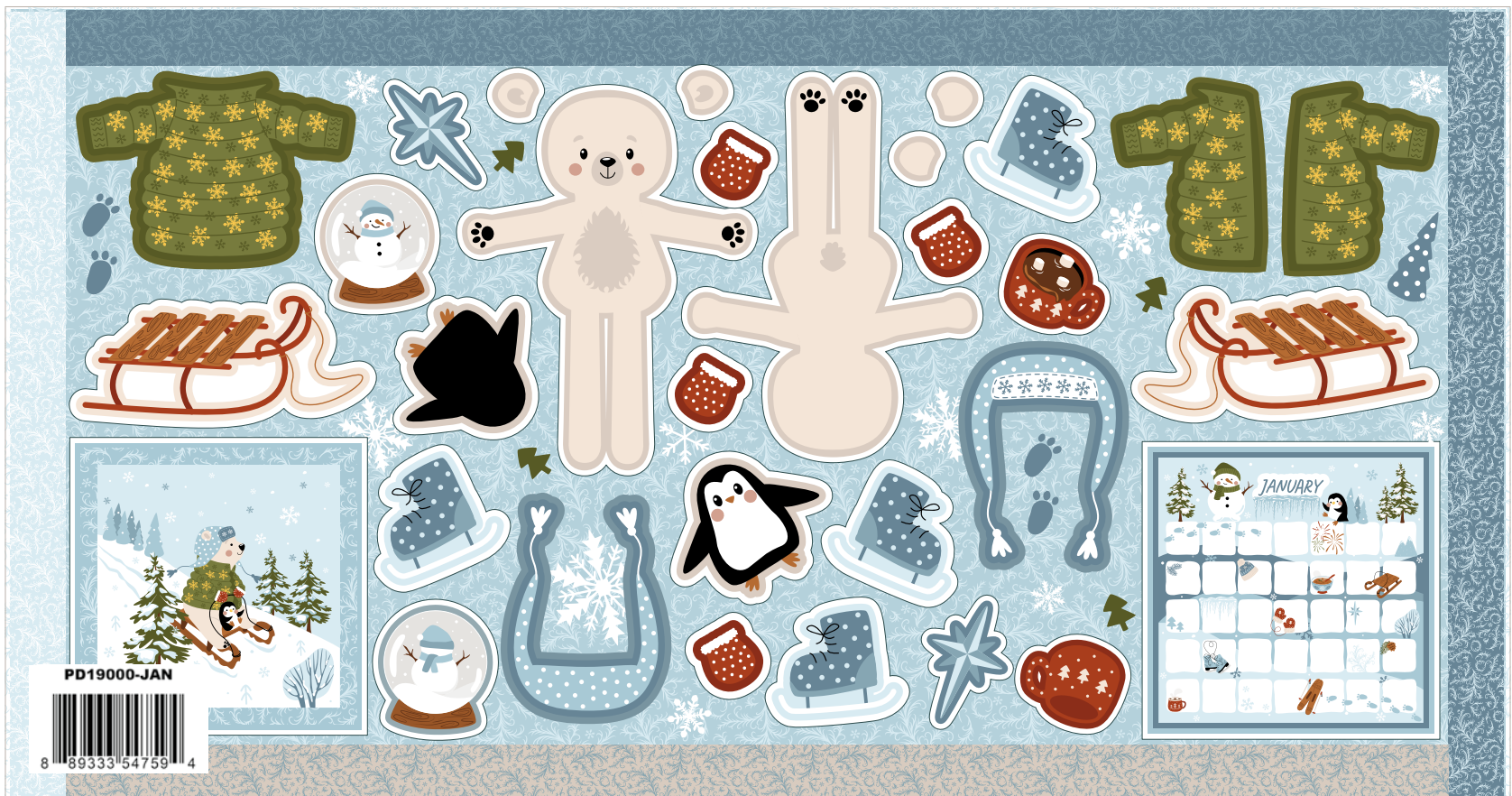
Story Animals Through the Year January Panel (10 panels per bolt)