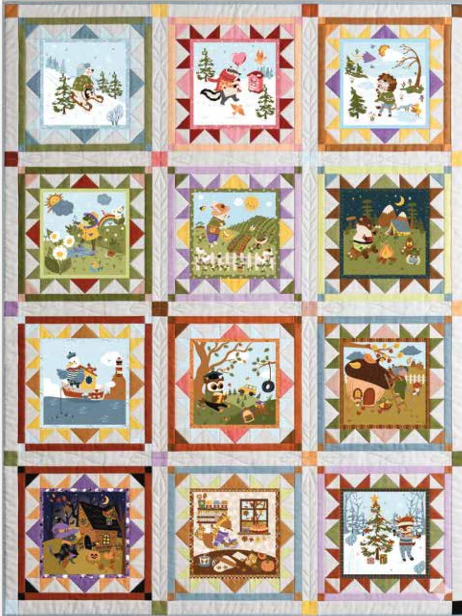
Calendar Quilt Size 63" x 83" (Final quilt design may change)