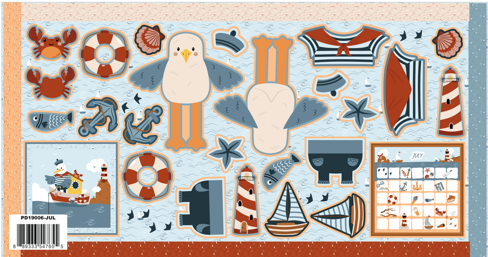
Story Animals Through the Year July Panel (10 panels per bolt)

Scaled to 15% | Actual Size is 57" x 36½"