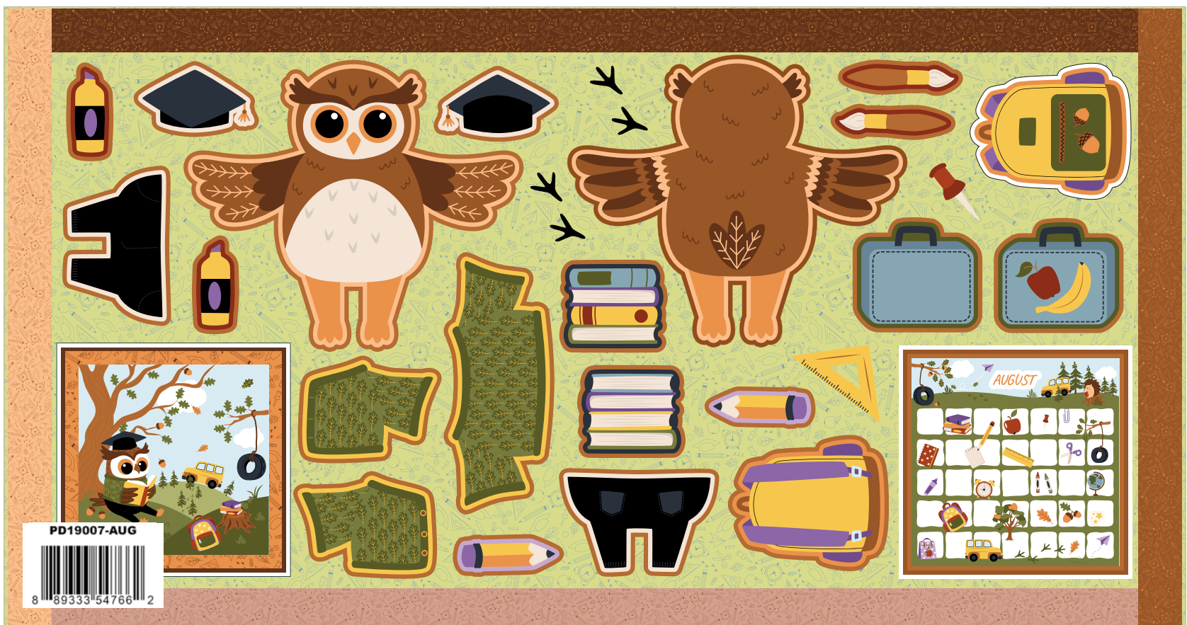
Story Animals Through the Year August Panel (10 panels per bolt)

Scaled to 15% | Actual Size is 57" x 36½"