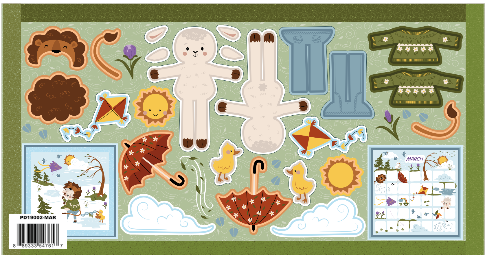
Story Animals Through the Year March Panel (10 panels per bolt)