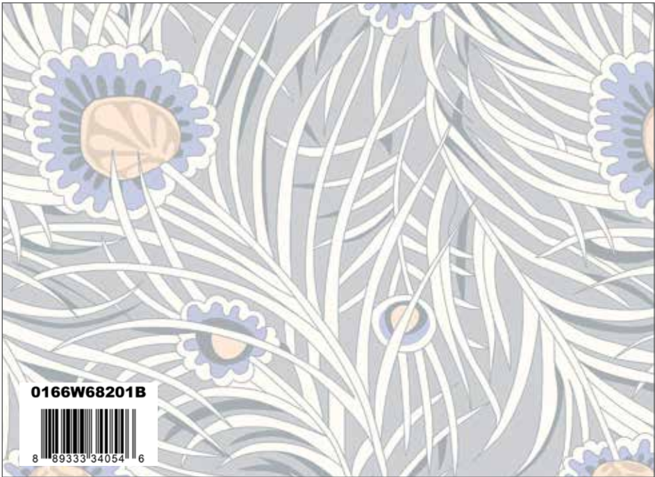
Peacock Dance B