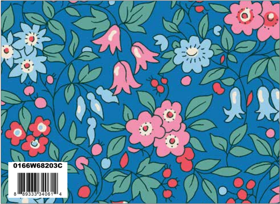
Trailing Blossom C