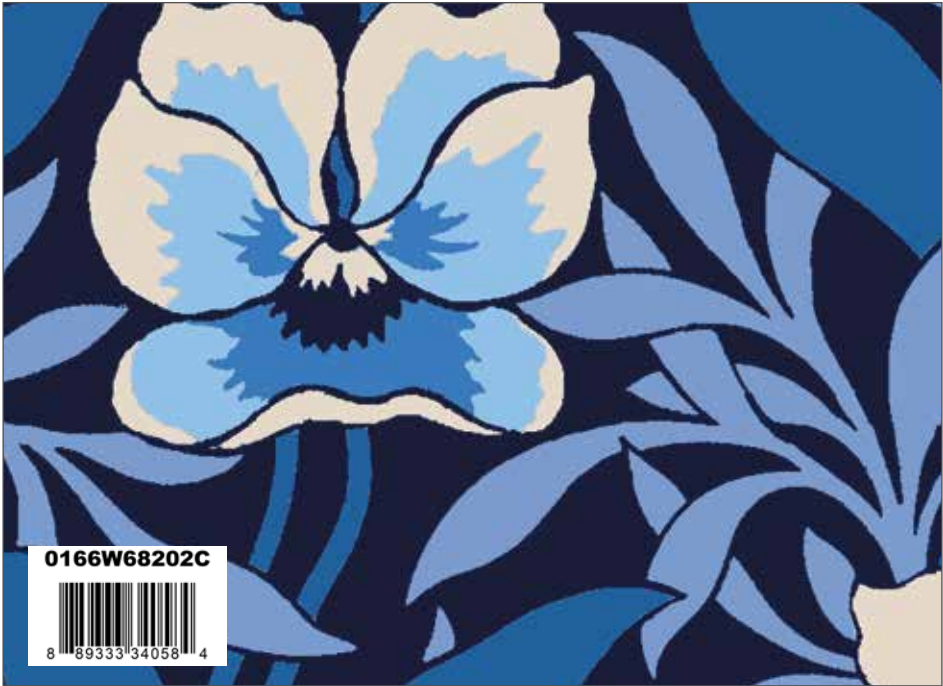
Pansy Meadow C