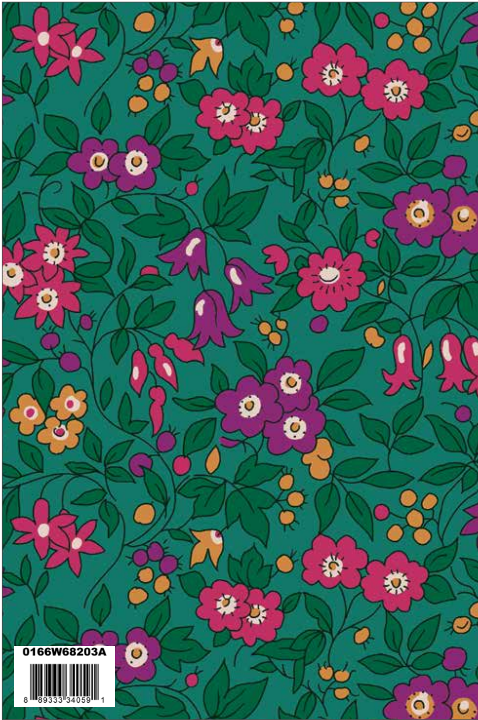
Trailing Blossom A