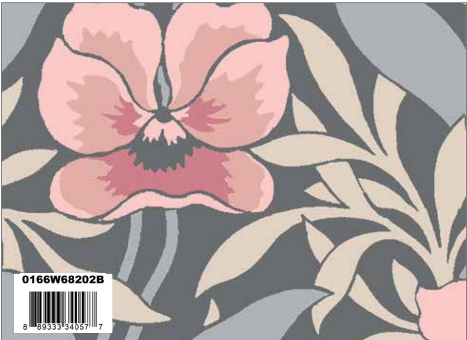
Pansy Meadow B