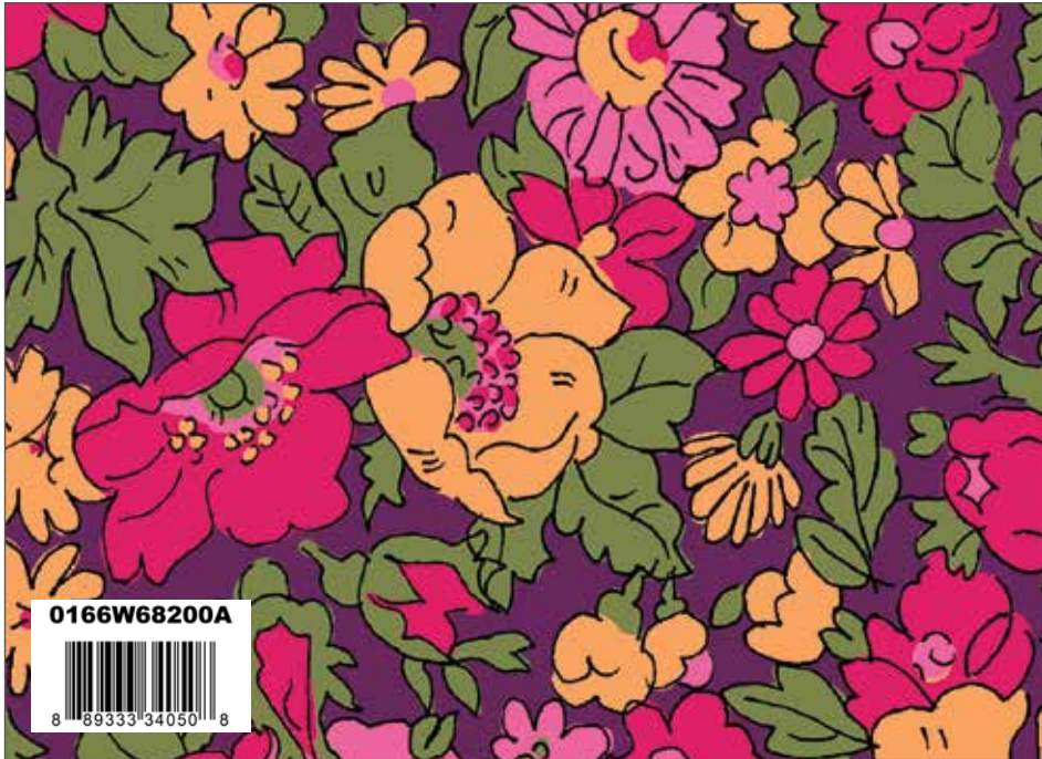
Cosmos Park A2