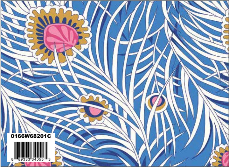
Peacock Dance C