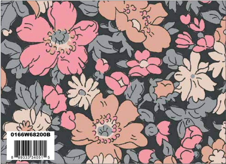
Cosmos Park B