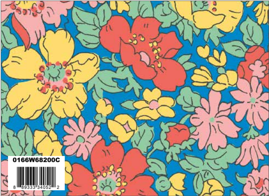
Cosmos Park C