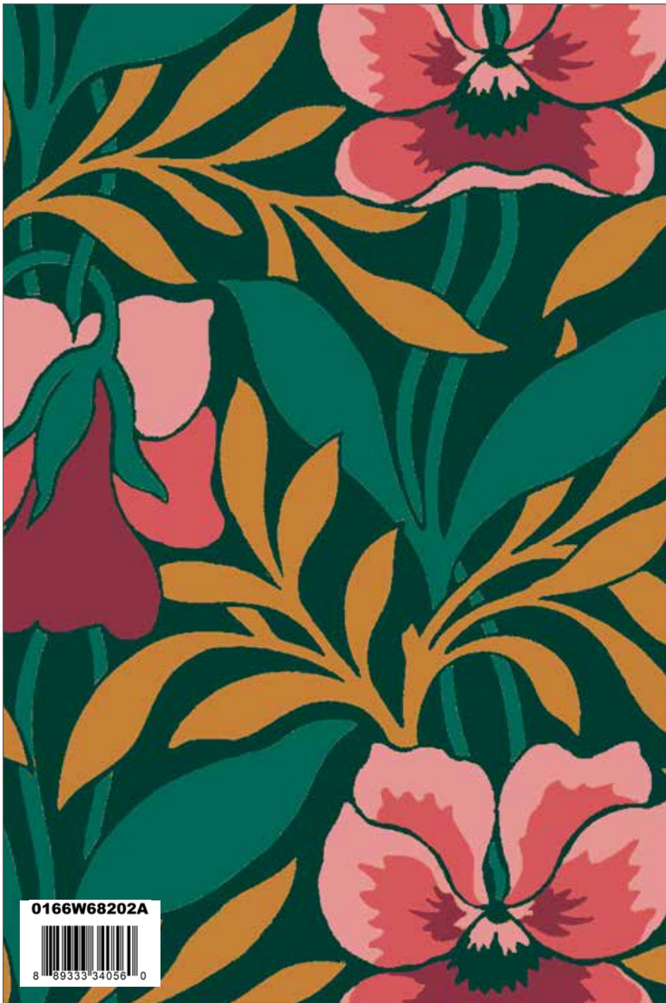
Pansy Meadow A