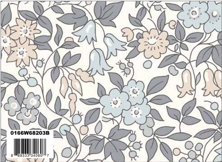
Trailing Blossom B