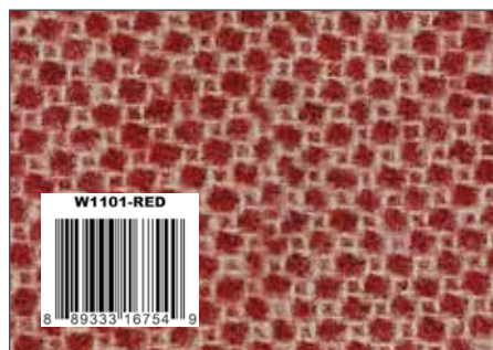
Red Cream Dot