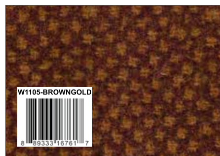
Brown Gold Diamond