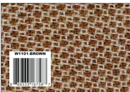
Brown Cream Dot