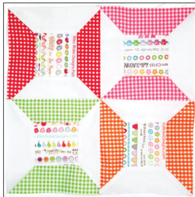
Selvage Spool Block