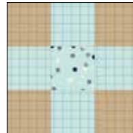
Blue Nine-Patch Block

Sew 1 pink waffle cone 2\frac{1}{2} " square, 4 cream sprinkles 2\frac{1}{2} " squares, and 4 pink sprinkles 2\frac{1}{2} " squares together to create a Pink Nine-Patch Block. Repeat to create 6 Pink Nine-Patch Blocks.