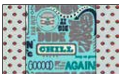
Center Unit D

Sew a light gray drops 2\frac{1}{2} " x 6\frac{1}{2} " rectangle to each side of an assorted print 6\frac{1}{2} " square to create Center Unit D. Repeat to make 15 Center Unit Ds.