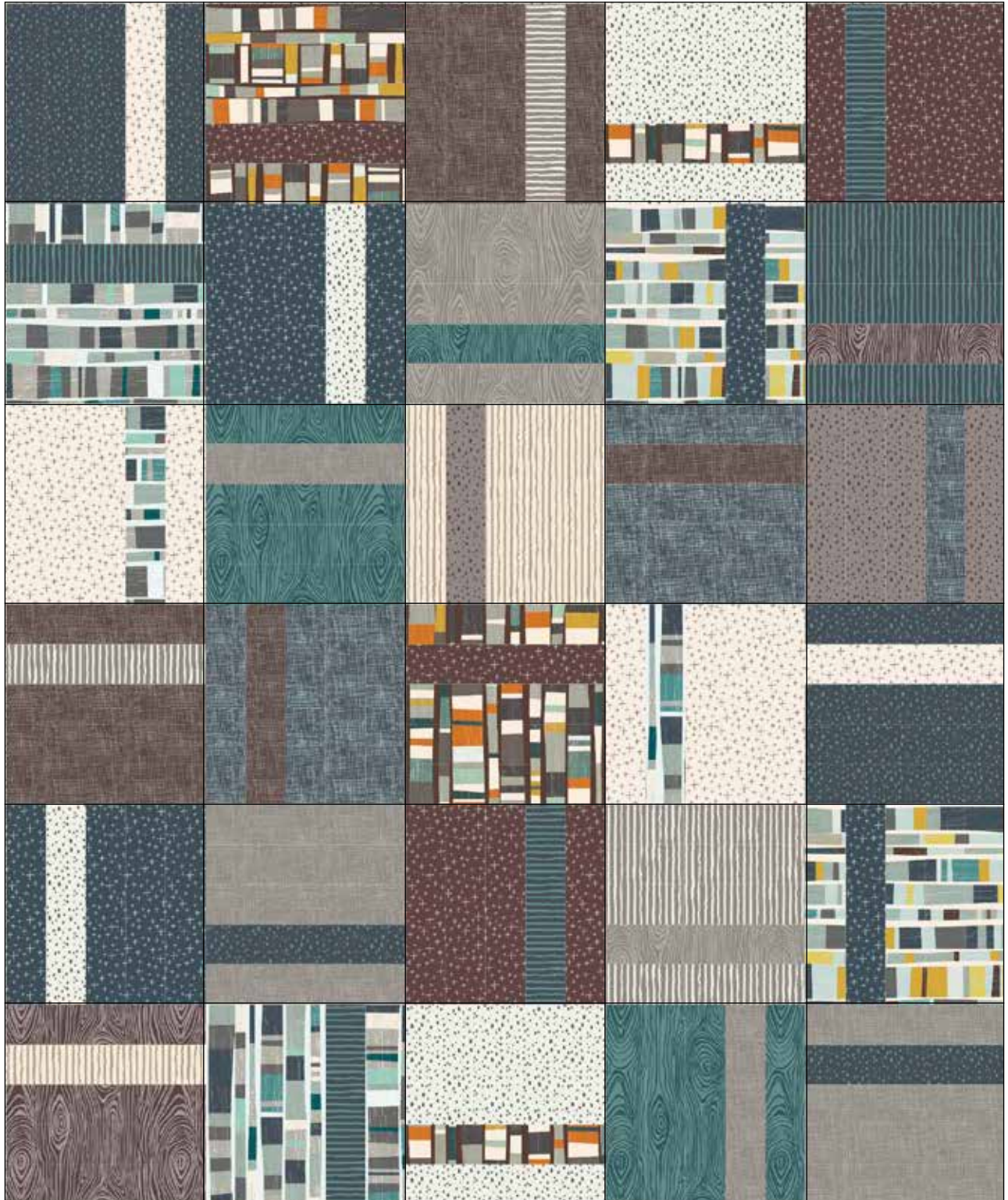
Quilt Center Diagram