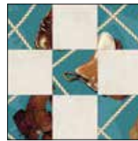
Nine-Patch A Block

Sew 4 assorted print 4½" squares and 5 cream shade 4½" squares together to create a Nine-Patch B Block. Repeat to create 9 Nine-Patch B Blocks.