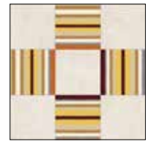
Nine-Patch B Block