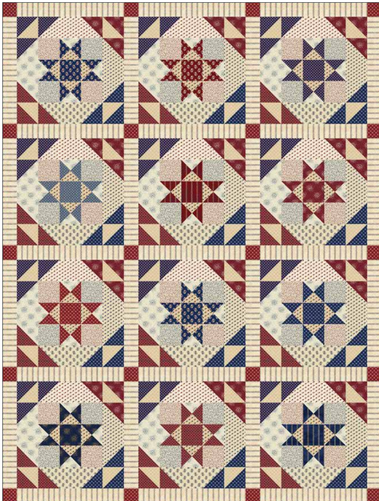
Quilt Center Diagram